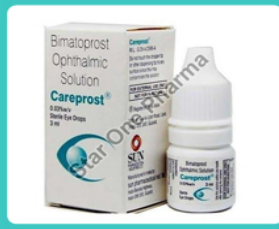
Careprost Eye Drop