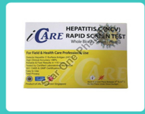
iCare Hepatitis C Test Kit