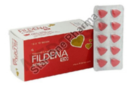
Fildena Strong-120 Tablets