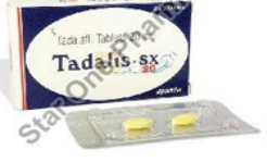
Tadalis-SX 20 Tablets