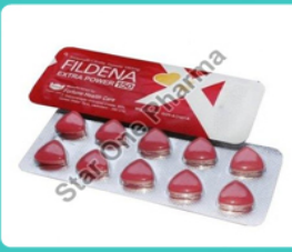
Fildena Extra Power-150 Tablets