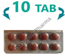
Super Valettra Tablets