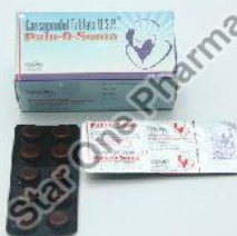
Pain-O-Soma 350mg Tablets