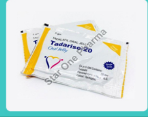
Tadarise Oral Jelly