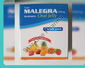
Malegra Oral Jelly