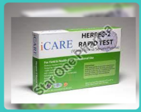
iCare Herpes II Test Kit