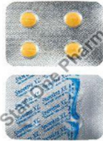
Snovitra XL-60 Tablets