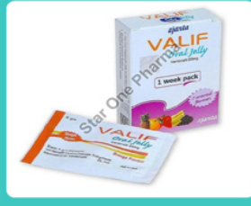
Valif Oral Jelly