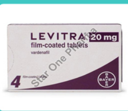
Levitra 20mg Tablets