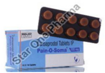
Pain-O-Soma 500mg Tablets