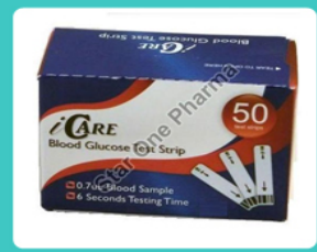
Icare Blood Glucose Test Strips