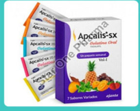
Apcalis-SX Oral Jelly