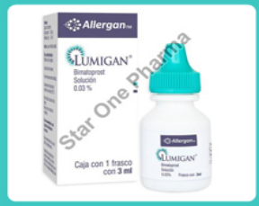
Lumigan Eye Drop