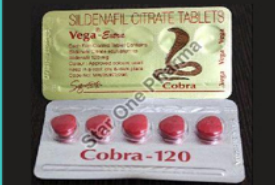
Vega Extra Cobra-120 Tablets