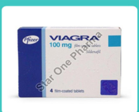
Viagra 100mg Tablets