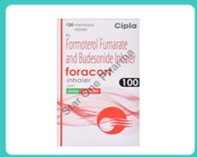
Foracort 100 Inhaler