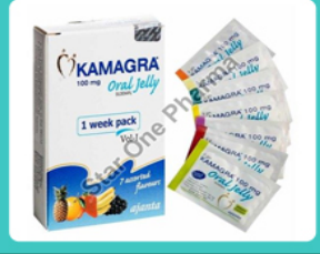
Kamagra Oral Jelly