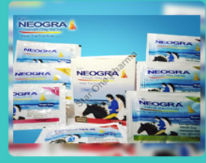
Neogra Oral Jelly