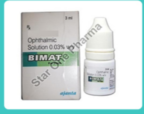
Bimat Eye Drop