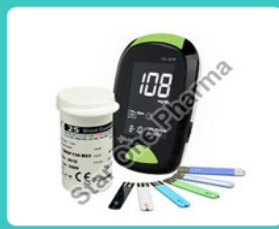
Icare Blood Glucose Meter