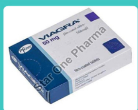
Viagra 50mg Tablets