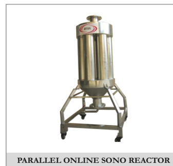
PARALLEL ONLINE SONO REACTOR