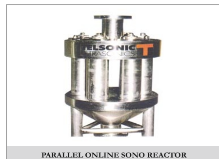
PARALLEL ONLINE SONO REACTOR