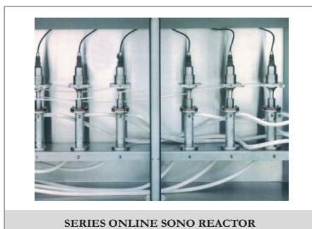
SERIES ONLINE SONO REACTOR