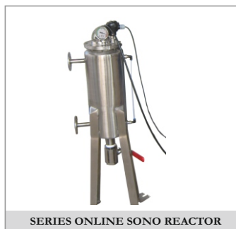
SERIES ONLINE SONO REACTOR