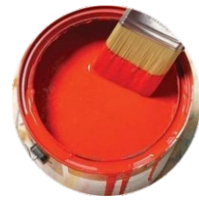
PAINT & EMULSIONS