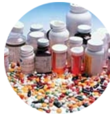
API BULK DRUG