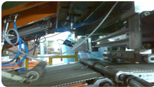
Tyre Slitting Machine