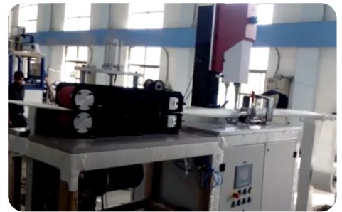
Geo-Drain Sealing Machine