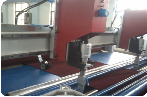
Automated Carpet Cutting and Sealing Machine