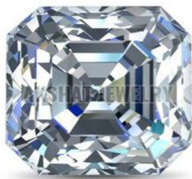
0.54 Carat Asscher Lab Grown Diamond