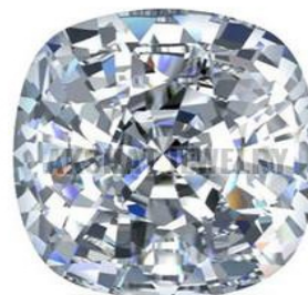
0.40 Carat Cushion Lab Grown Diamond