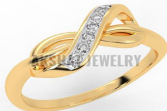
Infinity Diamond Gold Ring