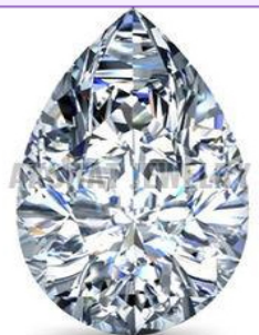
0.40 Carat Pear Lab Grown Diamond