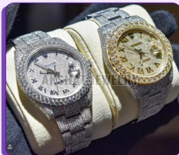
Round Cut Moissanite Diamond Wrist Watch