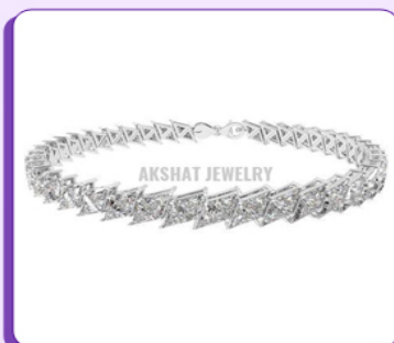
Lab Grown Diamond Bracelet