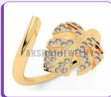
Adjustable Leaf Design Ring