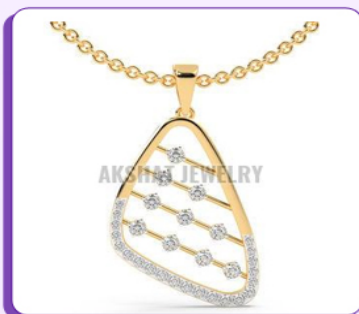
Stylish Diamond Pendant