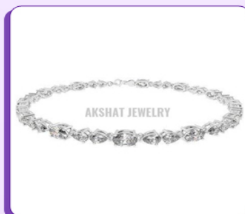
Sleeping Oval and Pear Shape Lab Grown Diamond Bracelet