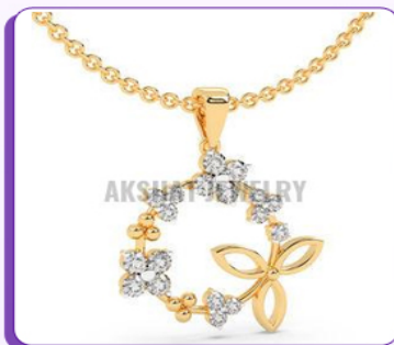
Enchanting Butterfly Circle Diamond Pendant