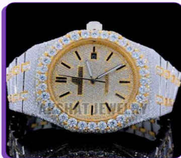
Round Moissanite Diamond Elegant Wrist Watch