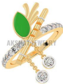
Krishna Flute Inspired Diamond Ring