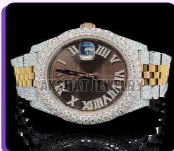
Round Criss Cross Design Moissanite Diamond Wrist Watch