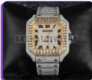
Round Moissanite Fully Diamond Studed Watch