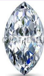
0.31 Carat Marquise Lab Grown Diamond