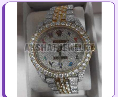
Round Fully Diamond Studded Watch