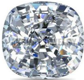
0.35 Carat Cushion Diamond