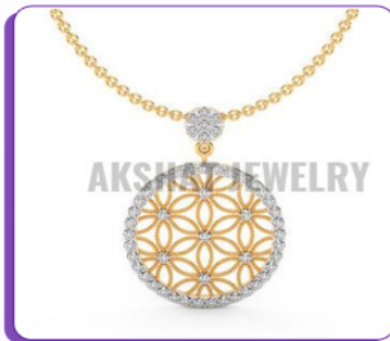
Circle of Elegance Diamond Pendant