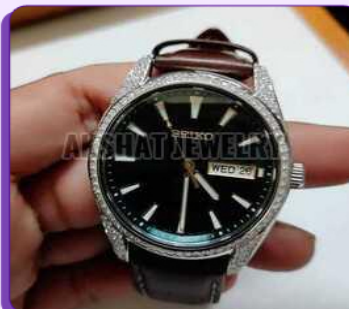
Designer Round Moissanite Diamond Wrist Watch