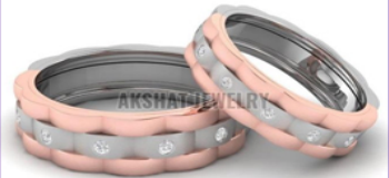
Stylish Couple Platinum Ring