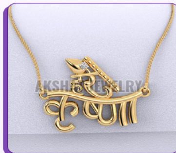
Hare Krishna Gold Pendant