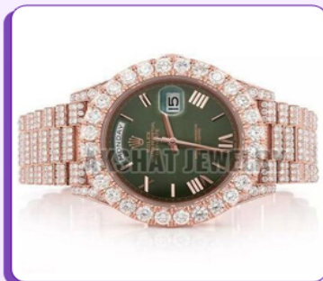
Round Cut Diamond Studded Watch