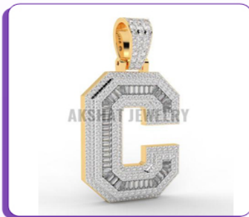
C Type Hiphop Diamond Pendant