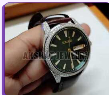
White Moissanite Trending Diamond Studded Wrist Watch