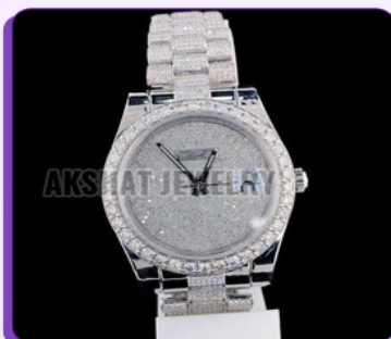
Trending Moissanite Diamond Studed Amazing Wrist Watch