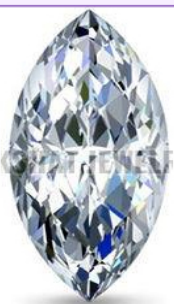
0.16 Carat Marquise Dia- mond