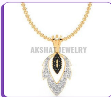
Dazzling Diamond Pendant