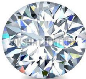
0.29 Carat Round Lab Grown Diamond