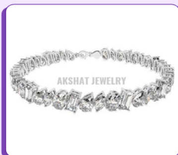
In Linear Line Different Shape Lab Grown Bracelet