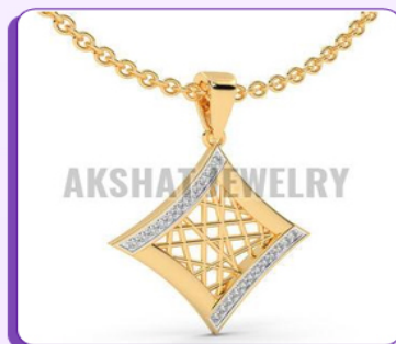
The Squad Design Diamond Pendant