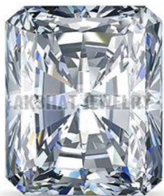
0.24 Carat Radiant Diamond