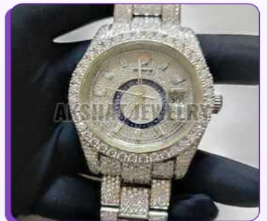
Real Diamonds Round Fully Studded Designer