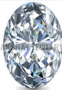
0.18 Carat Oval Diamond