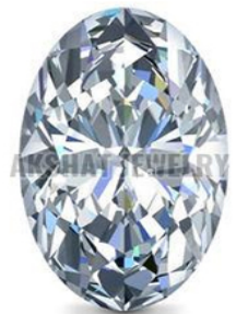
0.31 Carat Oval Lab Grown Diamond