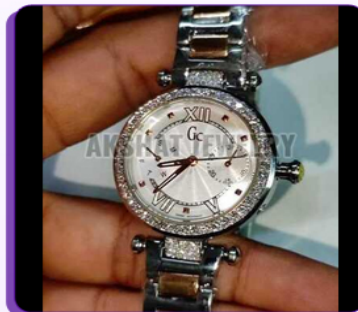
Round Sparkling Look Wrist Watch