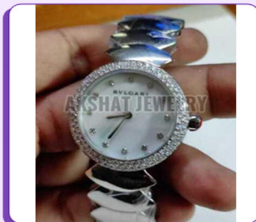
Round Fancy Moissanite Diamond Wrist Watch