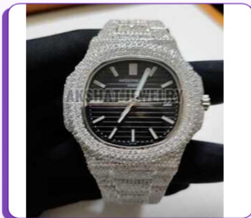
Latest Moissanite Round Cut Diamond Watch