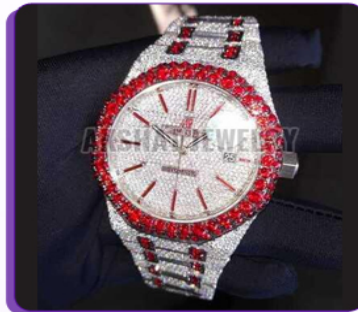
Round Gorgeous Moissanite Diamond Studded Wrist Watch