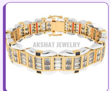
Fancy Diamond Bracelet