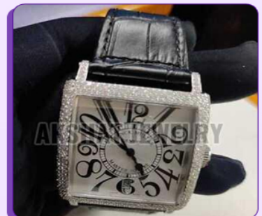
Designer Square Diamond Moissanite Watch