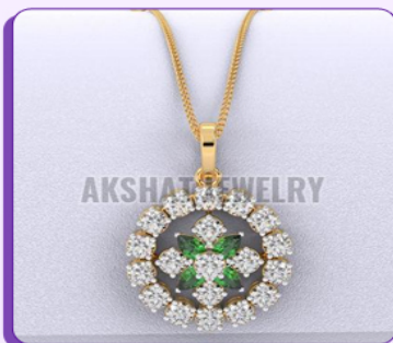
Pear Emerald Round Gold Pendant