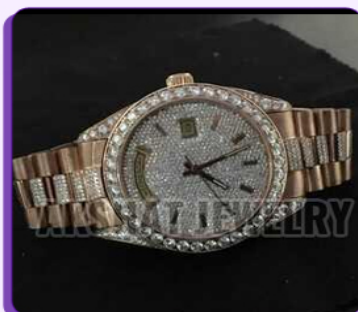
Trending Moissanite Diamond Studed Wrist Watch