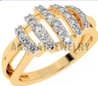
Five Strap Design Diamond Ring