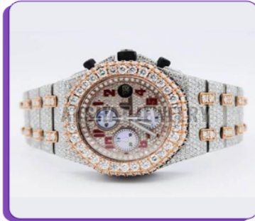
Fine Moissanite Diamond Watch