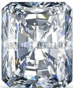
0.23 Carat Radiant Lab Grown Diamond