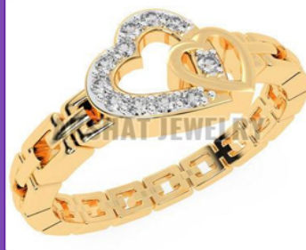
Twin Heart Diamond Ring