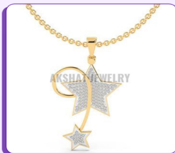
Stylish Stary Design Diamond Pendant