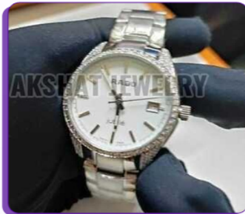
Round Gorgeous Moissanite Diamond Studded Watch