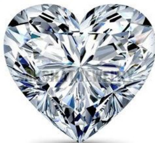
0.32 Carat Heart Lab Grown Diamond