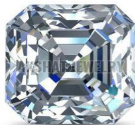
0.30 Carat Asscher Diamond