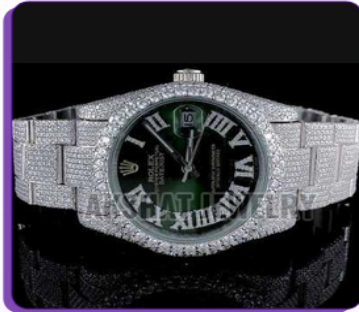
Fabulous Moissanite Diamond Studded Watch