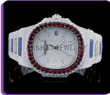
Diamond Studded Exclusive Moissanite Diamond Wrist Watch