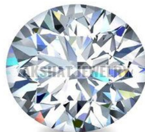
0.18 Carat Round Diamond