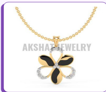
Designer Enamel Design Diamond Pendant