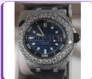
Round Elegant New Pattern Diamond Wrist Watch