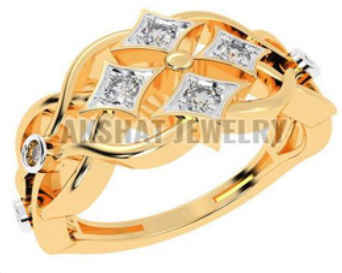
Intricate Jali Design Ring