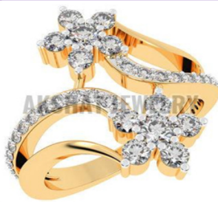
Twin Flower Designer Diamond Ring