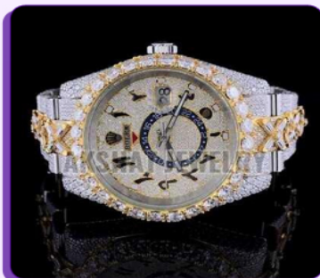
Real Diamonds Round Moissanite Diamond Watch