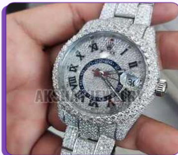
Latest White Moissanite Diamond Studded Wrist Watch