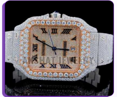
Fully Diamond Designer Studded Moissanite Wrist Watch