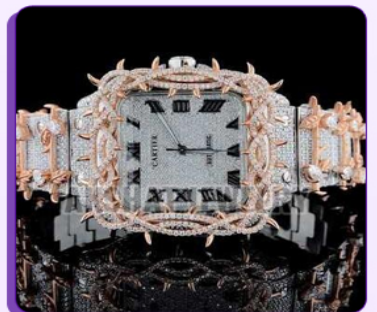
Round Cut Fully Studded Diamond Watch