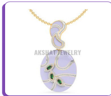
Dazzle Spark Diamond Pendant