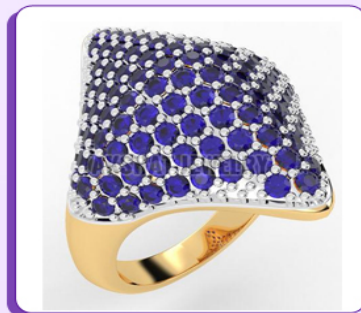
Blue Gems Gold Ring