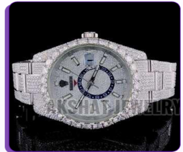
Round Labgrown Handmade Diamond Watch