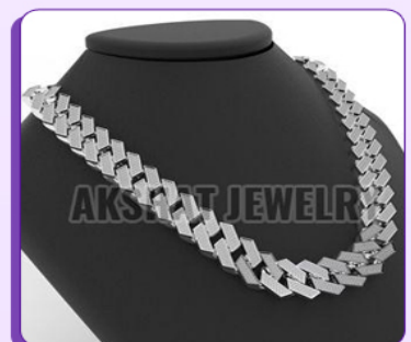
Hiphop Cuban Chain