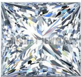
0.31 Carat Princess Lab Grown Diamond