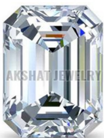
0.41 Carat Emerald Lab Grown Diamond