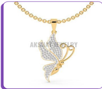
Butterfly Wings Diamond Pendant