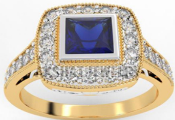
Blue Gemstone Diamond Rings