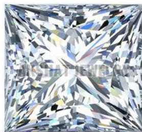
0.26 Carat Princess Diamond