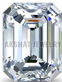
0.18 Carat Emerald Diamond