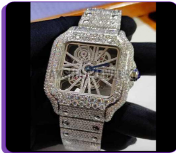
Round Fully Iced Out Moissanite Diamond Watch