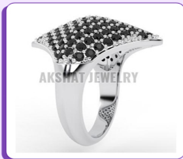
Black Diamond Ring