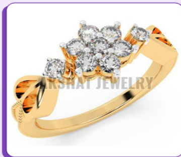
Blossom Brilliance Flower Diamond Ring