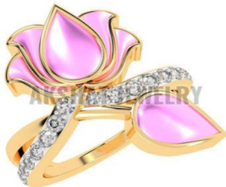
Exquisite Lotus Design Diamond Ring