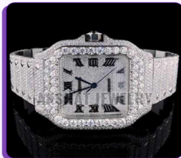
Real Diamonds Round Classic Wrist Watch