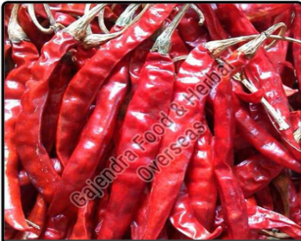
Dried Red Chilli