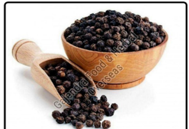
Black Pepper Seeds