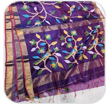
Handloom Resham Silk Jamdani Saree