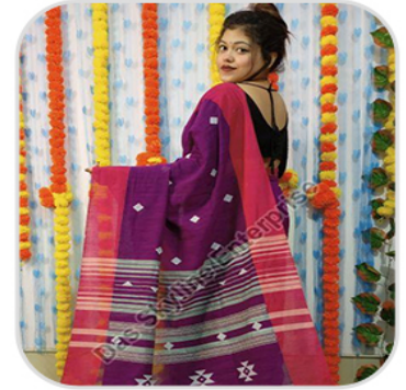
Ladies Handloom Cotton Jamdani Saree