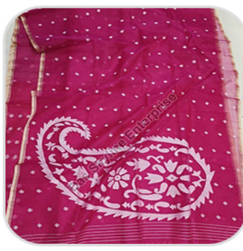
Designer Handloom Resham Silk Jamdani Saree