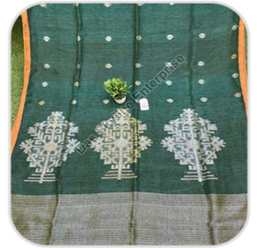
Designer Handwork Linen Saree