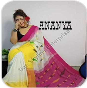
Ladies Traditional Handloom Saree