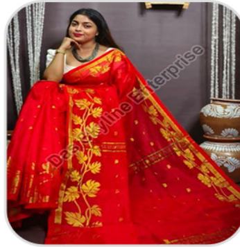
Ladies Red Handloom Saree