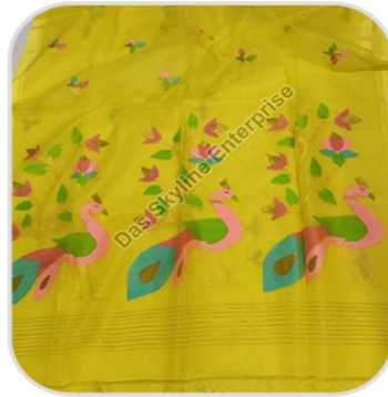
Designer Handloom Silk Jamdani Saree