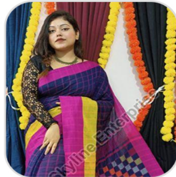
Resham Silk Handloom Jamdani Saree