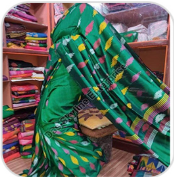
Ladies Handloom Cotton Silk Jamdani Saree