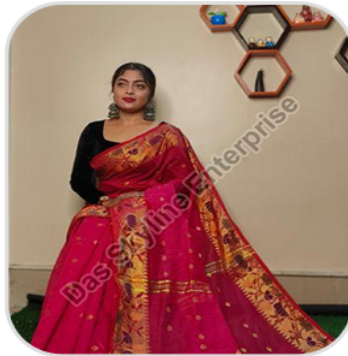
Ladies Handloom Cotton Silk Saree