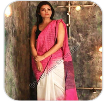
Ladies Pink & White Handloom Saree