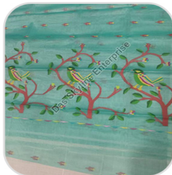
Designer Handloom Muslin Jamdani Saree