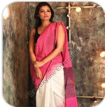
Designer Cotton Ikkat Handloom Saree