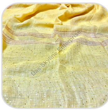
Ladies Handloom Sequence Saree