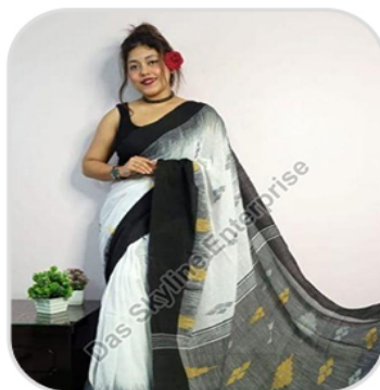
Handloom Cotton Kotki Saree