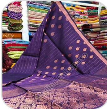
Pure Linen Handloom Saree