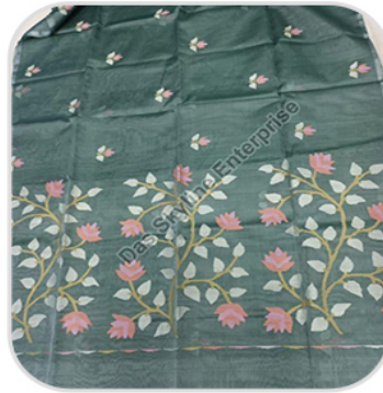
Designer Handloom Work Jamdani Saree