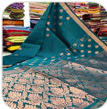
Ladies Party Wear Handloom Jamdani Saree