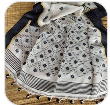
Ladies Linen Jamdani Saree