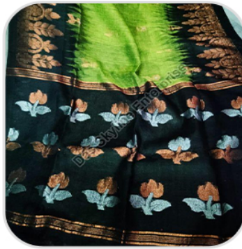
Handloom Linen Ikkat Saree