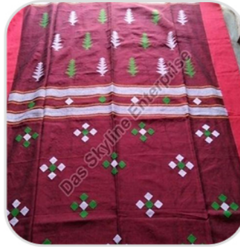
Ladies Printed Handloom Jamdani Saree