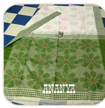
Handloom Cotton Printed Saree