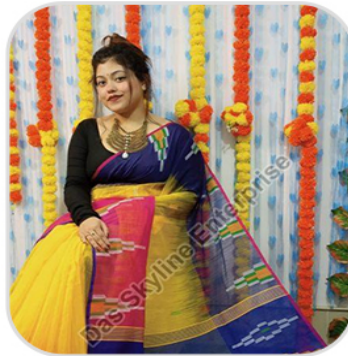
Ladies Multicolor Handloom Cotton Silk Saree