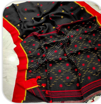
Handloom Linen Saree