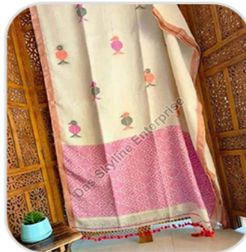
Ladies Linen Handloom Jamdani Saree