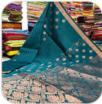
Designer Silk Handloom Saree