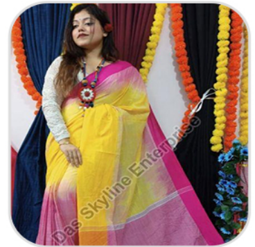
Cotton Handloom Khadi Saree