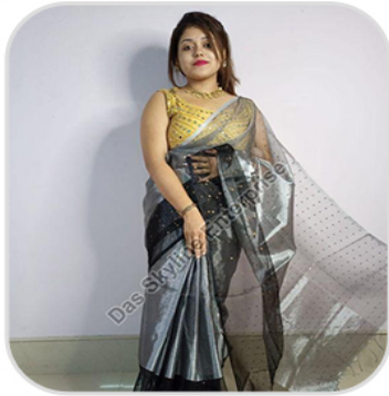
Designer Handloom Sequins Work Sarees