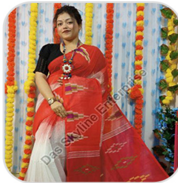
Handloom Cotton Silk Buti Saree