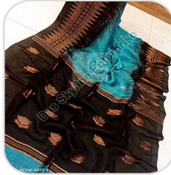
Ladies Stylish Handloom Jamdani Saree