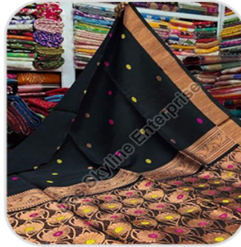
Ladies Festive Wear Handloom Jamdani Saree