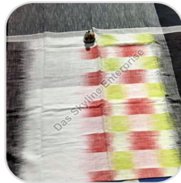
Handloom Cotton Ikkat Saree