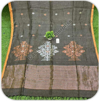
Ladies Casual Wear Handloom Jamdani Saree