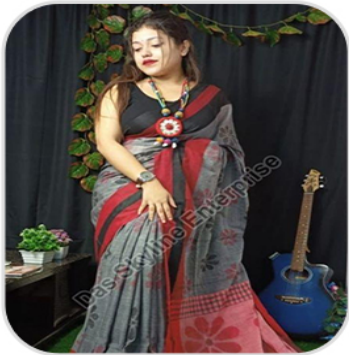
Ladies Casual Wear Printed Handloom Saree