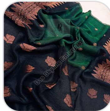
Designer Handloom Linen Saree