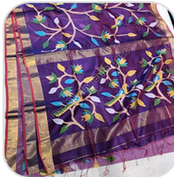
Designer Handloom Jamdani Saree