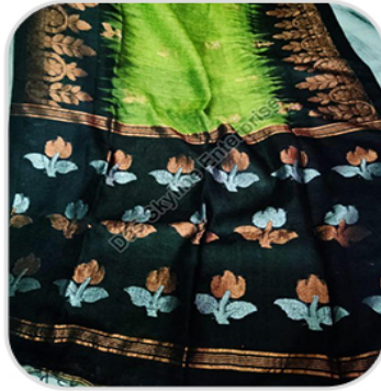
Ladies Fancy Handloom Jamdani Saree