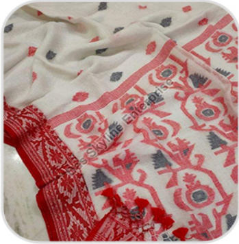
Ladies Printed Handwork Jamdani Saree