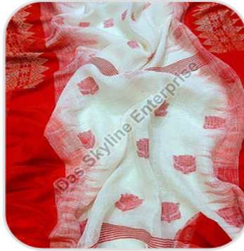
Ladies Red & White Handloom Jamdani Saree