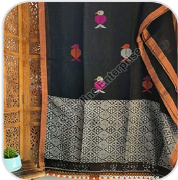
Party Wear Designer Handloom Linen Saree