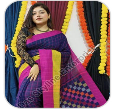
Ladies Casual Wear Cotton Handloom Saree