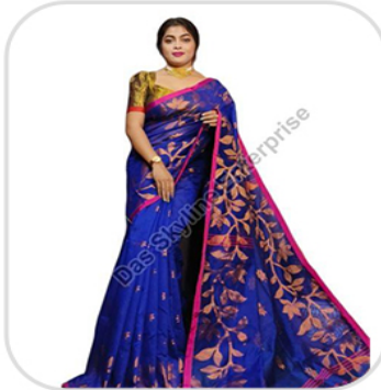
Ladies Dark Blue Handloom Saree