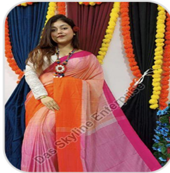
Ladies Multicolor Handloom Saree