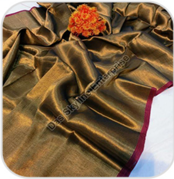
handloom cotton zari saree