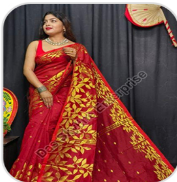
Ladies Printed Handloom Saree