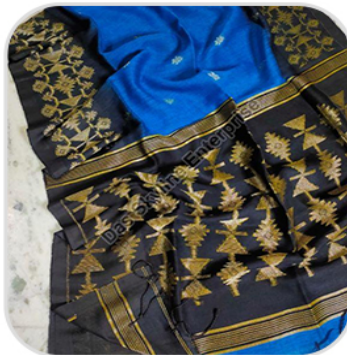
Ladies Indian Handloom Jamdani Saree