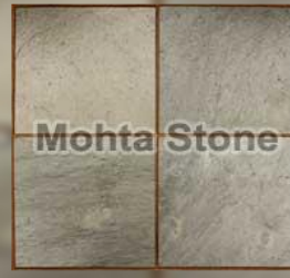
Ocean Green Slate Stone