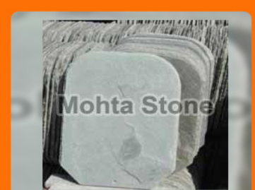
Grey Roofing Stone