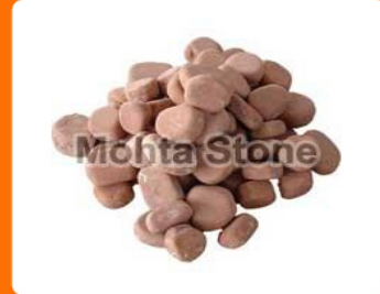
Agra Red Pebbles