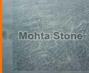
N Green Slate Stone