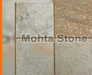
Zeera Green Slate Stone