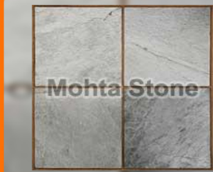
Silver Gray Slate Stone