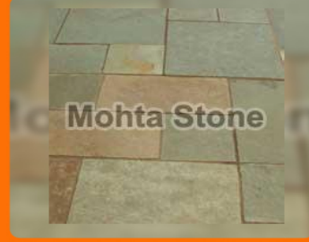
Kota Honey Limestones