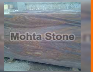
Rainbow Sandstone Slab