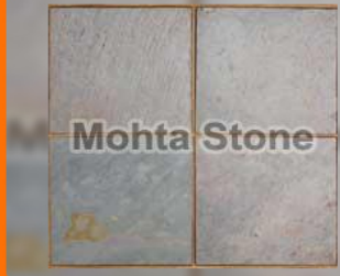
Kund Multi Slate Stone