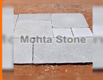
Tandur Grey Limestone