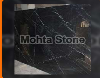
Zebra Black Marble Slabs