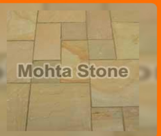
Lalitpur Yellow Sandstone