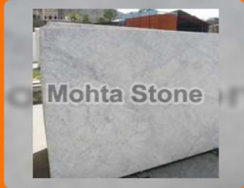
Purple White Marble Slabs