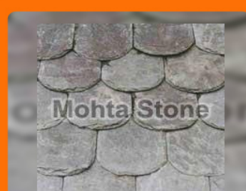
Black Roofing Stone