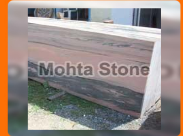
Pink Marble Slabs