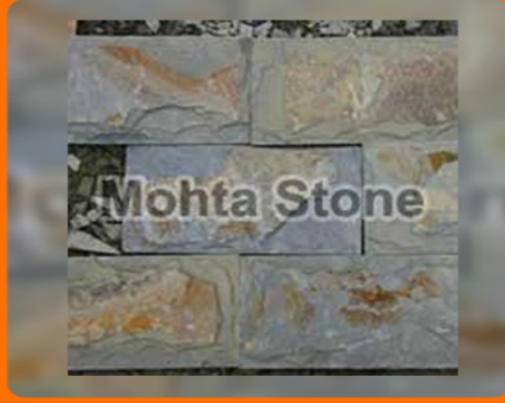
Slate Wall Stone