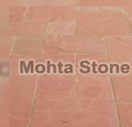
Agra Red Sandstone