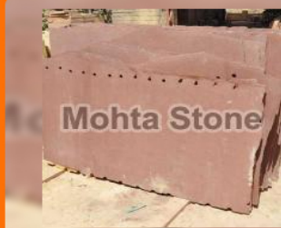
Red Sandstone Slab