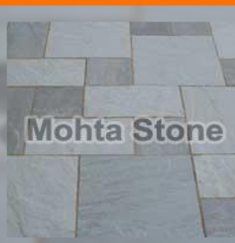
Kandla Gray Sandstone