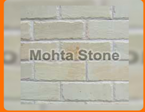
White Wall Stone