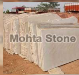
Dholpur Beige Sandstone Slab