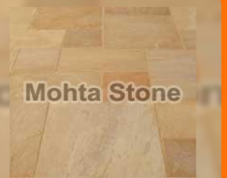
Autumn Brown Sandstone