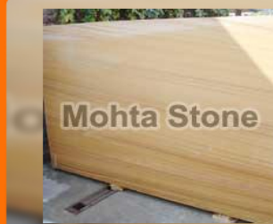
Teak Wood Sandston Slab