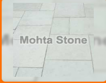
Kota Blue Limestones