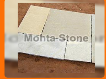
Tandur Yellow Limestone