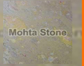
Peacock Slate Stone