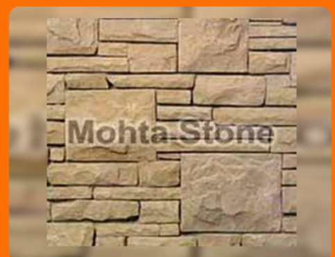
Yellow Wall Stone