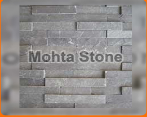
Black Slate Wall Stone