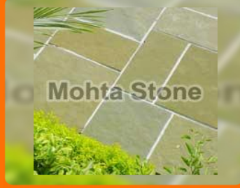
Kota Brown Limestones