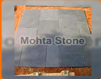
Kadappa Black Limestone