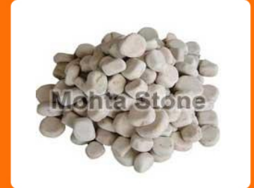
Dholpur White Pebbles