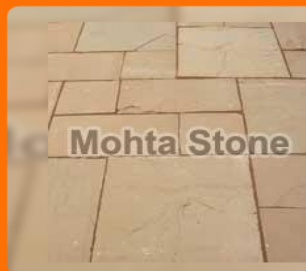
Dholpur Beige Sandstone