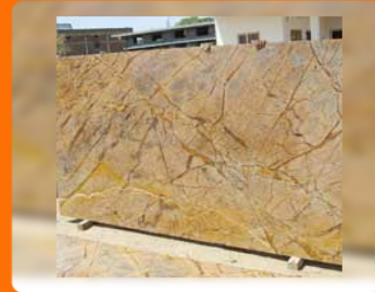
Rainforest Marble Slabs