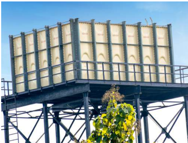
Jal Jeevan Mission – Assam