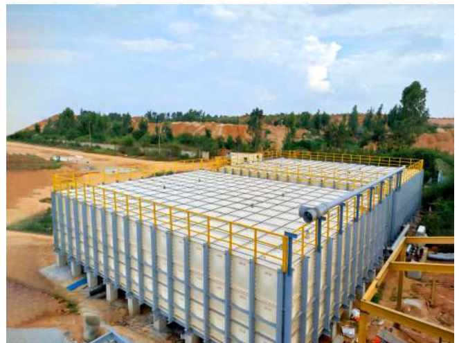
Kempegowda International Airport