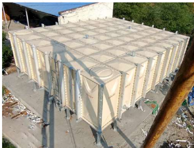
Himachal Pradesh Cricket Association