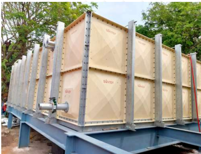
Mukesh Ambani House – Gujarat