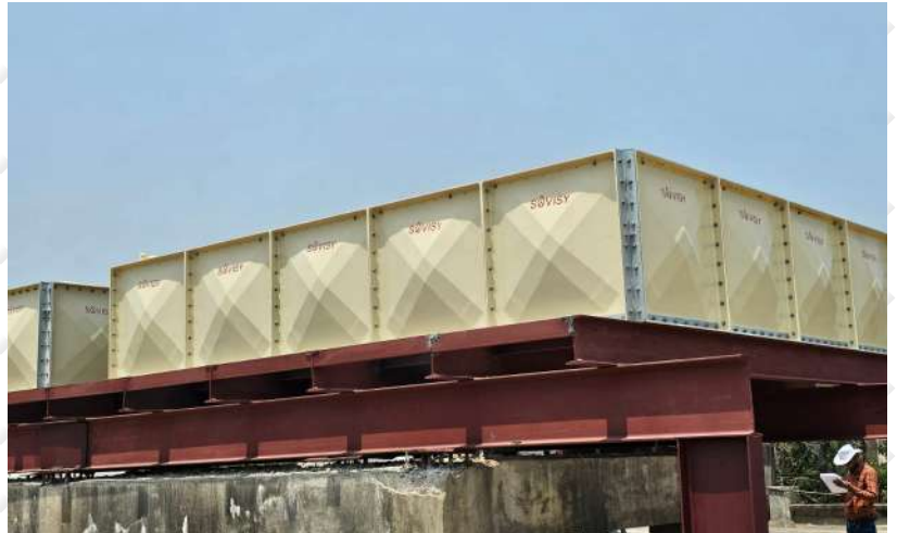
ESIC Hospital – Kolhapur