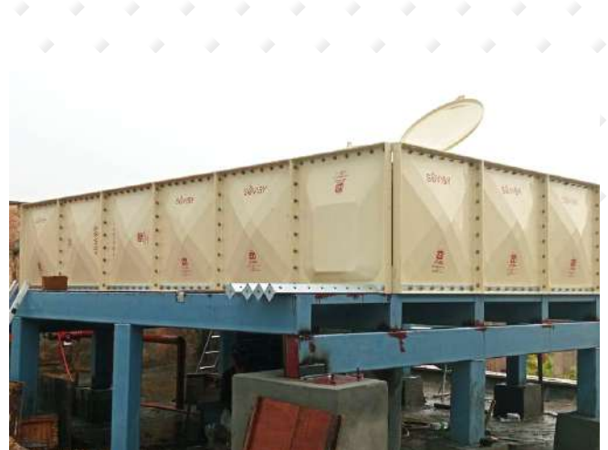
Supreme Court – New Delhi