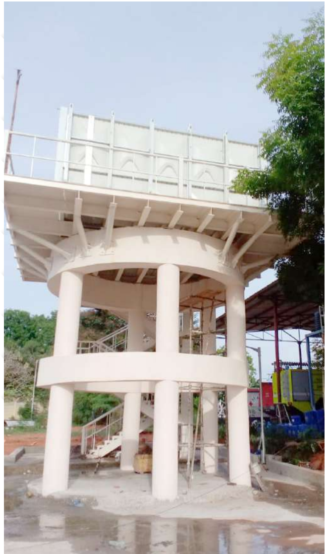
Puducherry Airport – Pondicherry