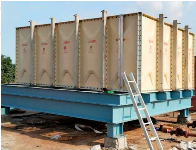
Fire Station: Chandni Chawk, NEW Delhi