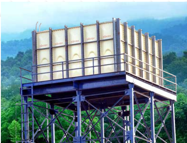
Jal Jeevan Mission – Assam