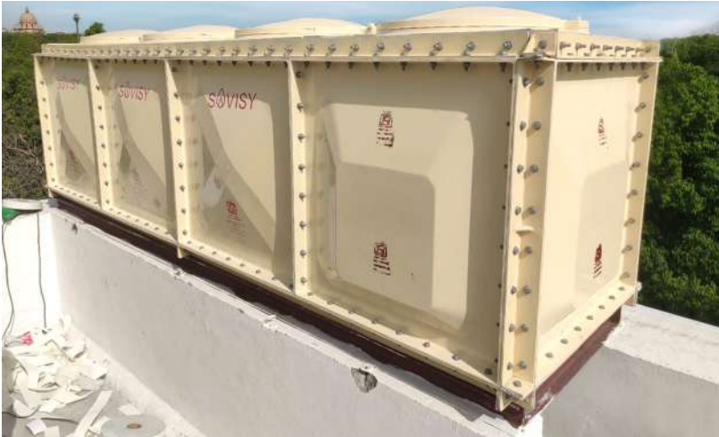
Rashtrapati Bhawan – New Delhi