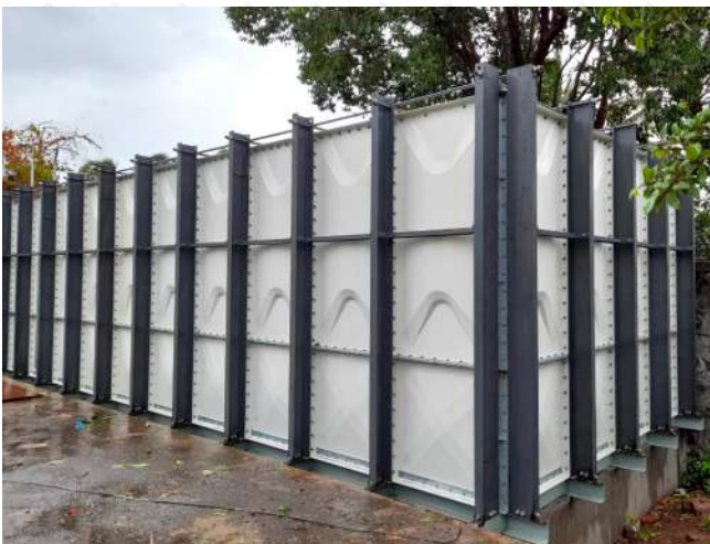
Reliance – Mumbai