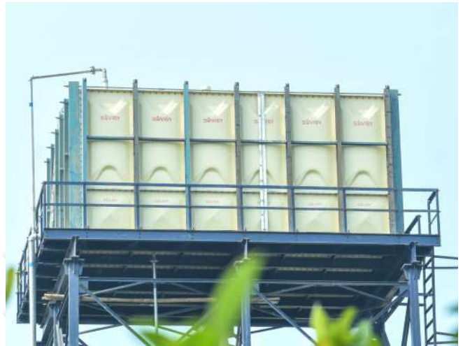
Jal Jeevan Mission – Assam