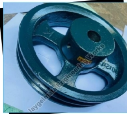
10x2xC V Belt Pulley