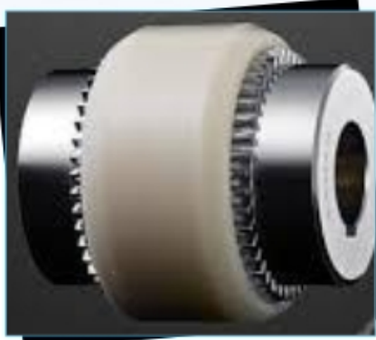
Naylon Gear & Sleeve Coupling