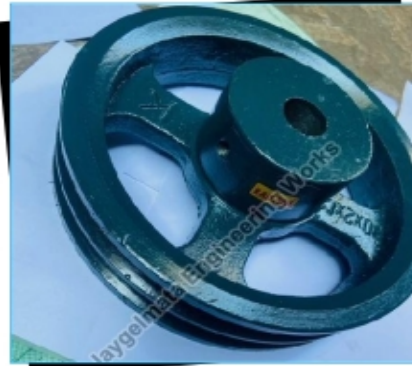
10x2xC Ara V Belt Pulley