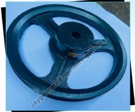
10x1xB V Belt Pulley