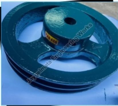
8x2xB Ara Type V Belt Pulley