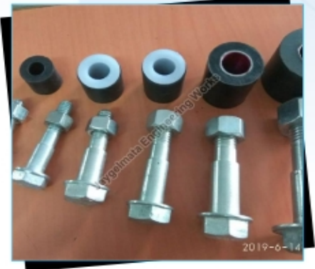
Bolt And Nut