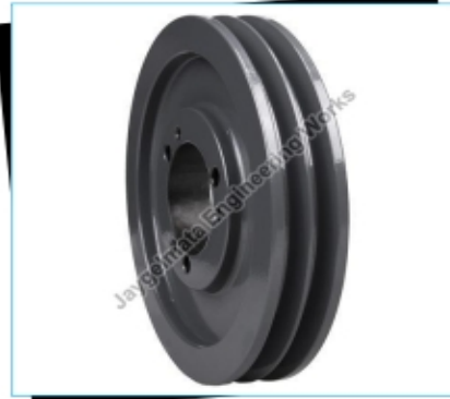
10x2xB Tapper Lock Pulley