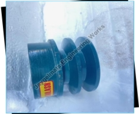
3x2xB V Belt Pulley