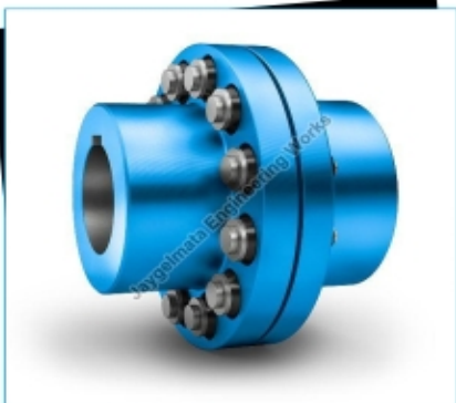
CI Pin Bush Coupling