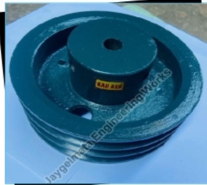
8x3xB Plate V Belt Pulley