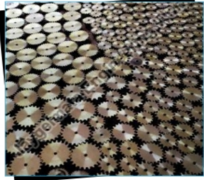
CI Conveyor Gear MS Chain Sprocket Gear