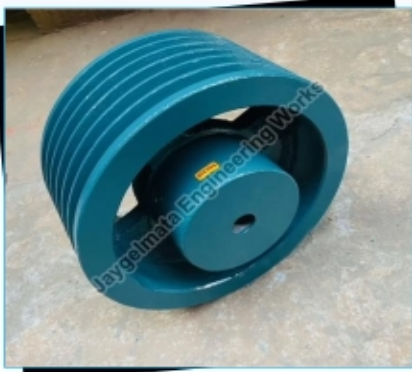
14x6xC Khada Type V Belt Pulley