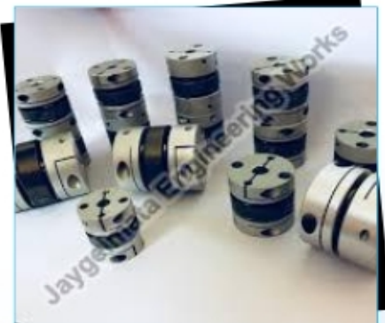
Flexible Disc Type Coupler