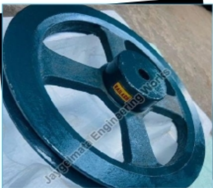
12x1xC V Belt Pulley