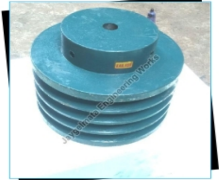
10x4xC Solid V Belt Pulley