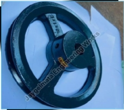
10x1xC V Belt Pulley