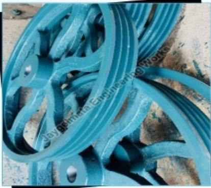
36x3xc V Belt Pulley