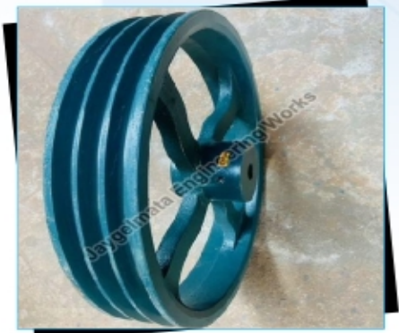
18x3xC Ara Type V Belt Pulley