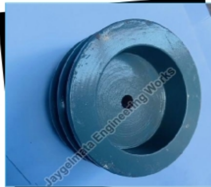
6x2xB Khada Type V Belt Pulley