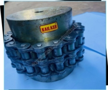
MS Chain Coupling