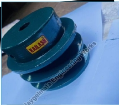
5x2xC Solid V Belt Pulley