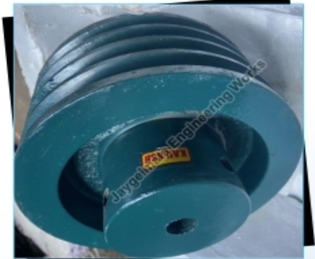
7.5''x4xB Khada Type V Belt Pulley