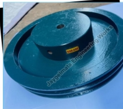
12x2xB Plate V Belt Pulley