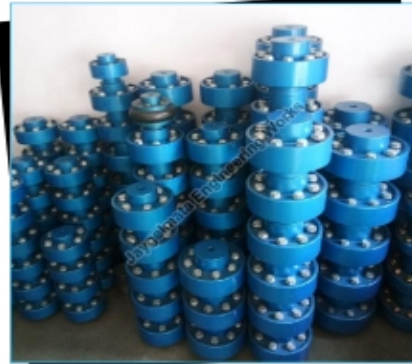
Flexible Pin Bush Coupling