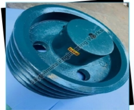
12x4xC Plate V Belt Pulley