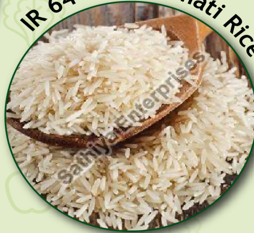
IR 64 Non Basmati Rice