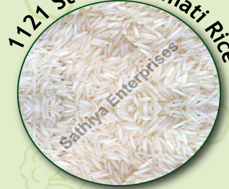
1121 Steam Basmati Rice