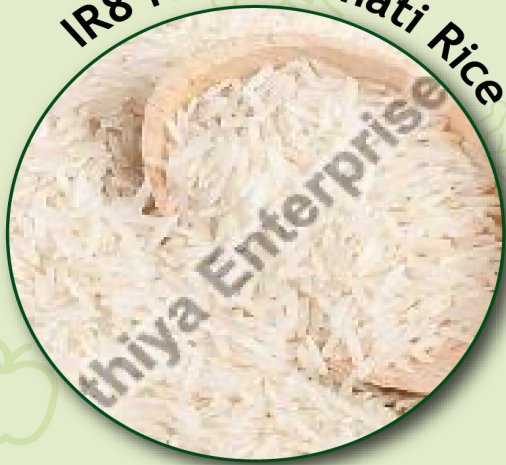
IR8 Non Basmati Rice