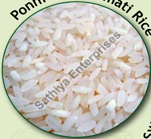
Ponni Non Basmati Rice