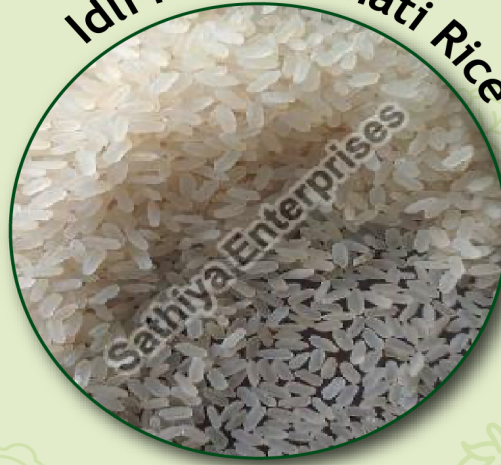
Idli Non Basmati Rice