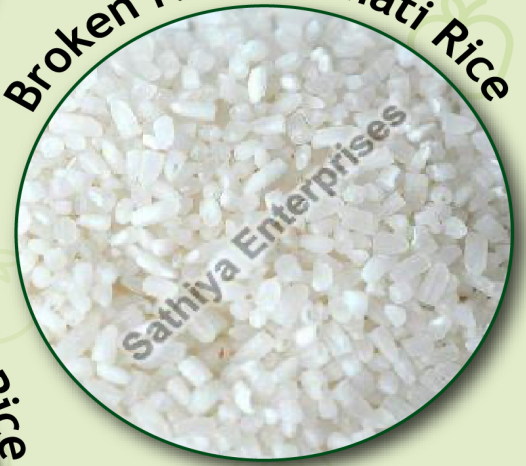
Broken Non Basmati Rice