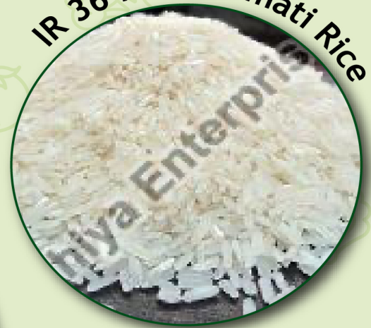
IR 36 Non Basmati Rice