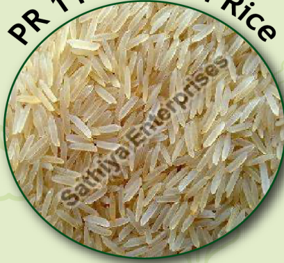
PR 11 Basmati Rice