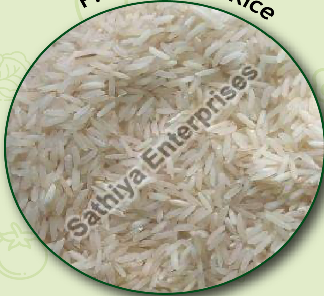
PR 11 Steam Rice