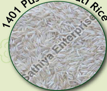
1401 Pusa Basmati Rice