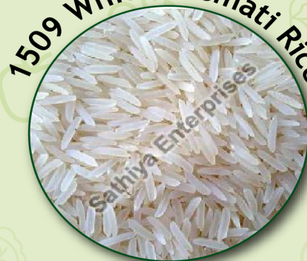
1509 White Basmati Rice