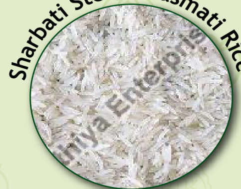
Sharbati Steam Basmati Rice