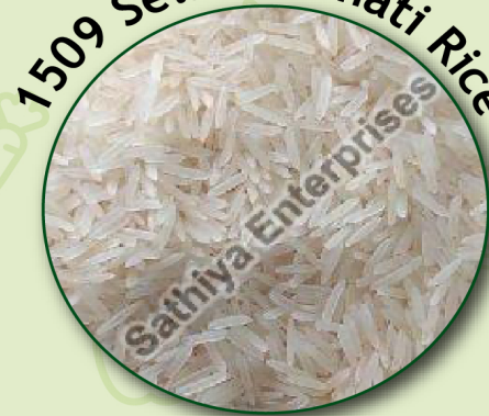
1509 Sella Basmati Rice