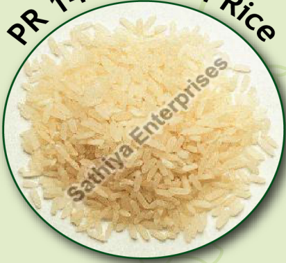
PR 14 Basmati Rice