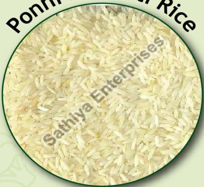
Ponni Basmati Rice