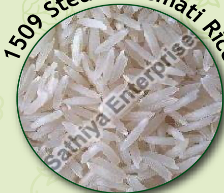
1509 Steam Basmati Rice