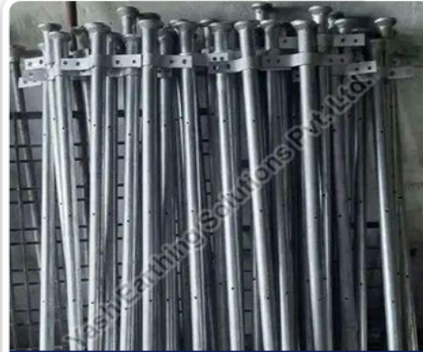
5 Feet Funnel Pipe