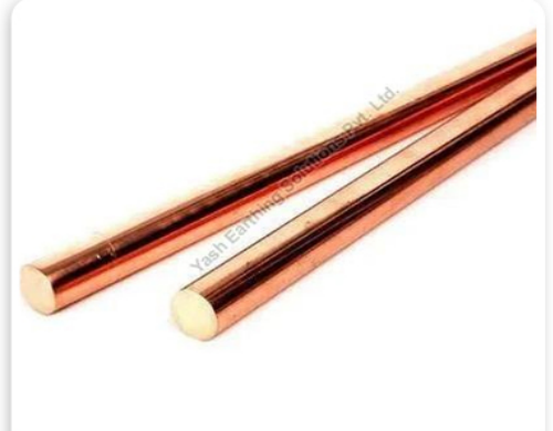
Industrial Copper Rod