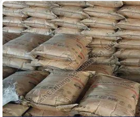
Bentonite Chemical Powder