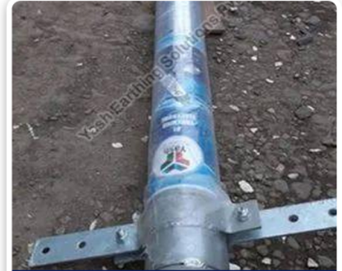
50 mm GI Earthing Pipe