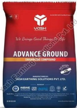
5 Kg Advanced Ground Enhancing Compound