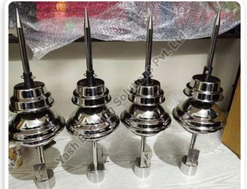
Stainless Steel Lightning Arrester