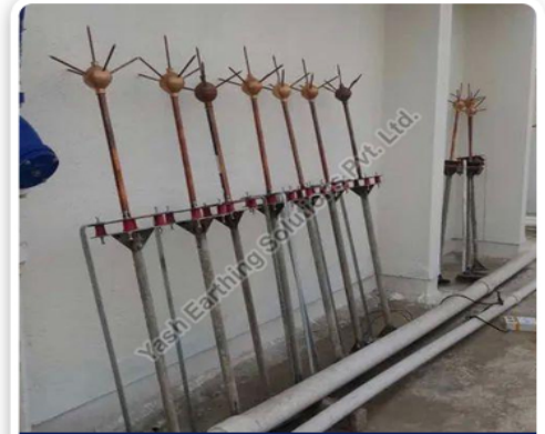
Copper Spike Lightning Arrester