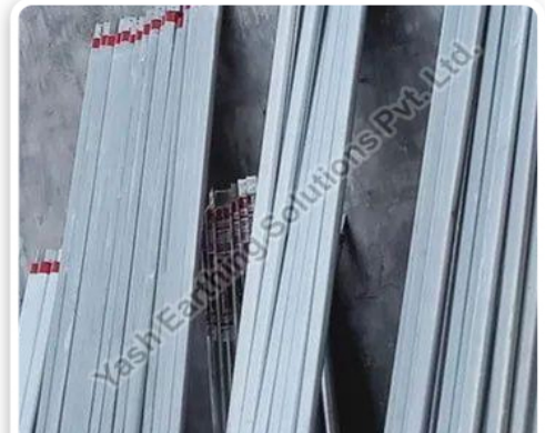
Galvanized Iron Earthing Electrode