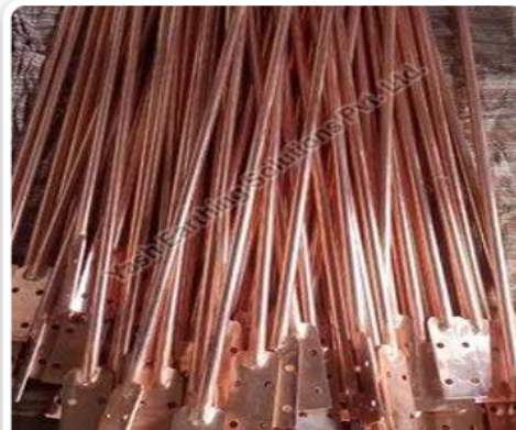
YG-CBR173 Earthing Rod