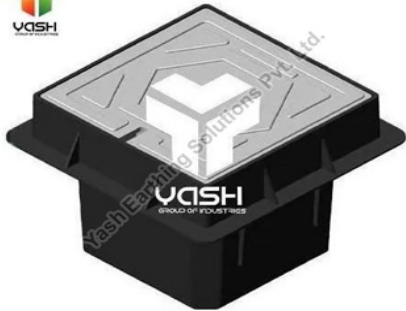
FRP Square Earth Pit Cover