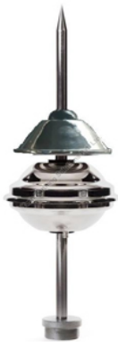
ESE Lightning Arrester