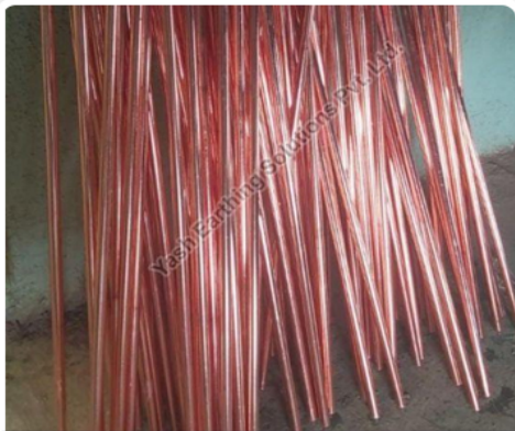
17.2 mm Copper Bonded Earth Rod