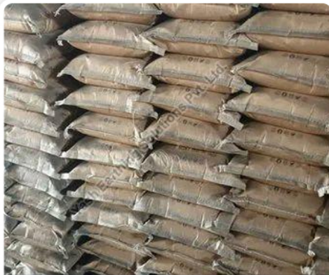
Sodium Based Bentonite Powder