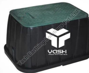
FRP Pit Cover