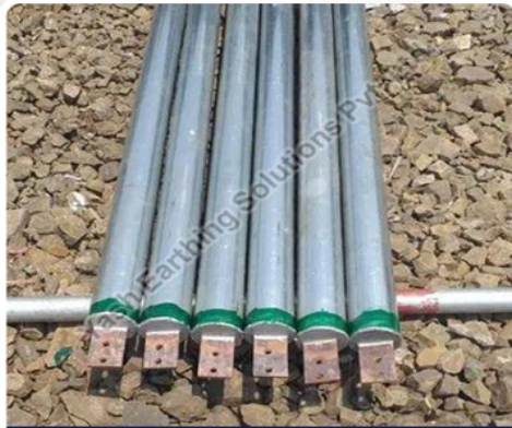
2.5 Meter Gel Earthing Electrodes