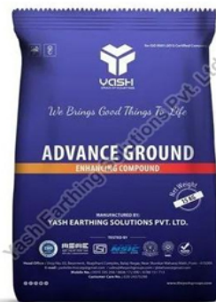
15 Kg Advanced Ground Enhancing Compound