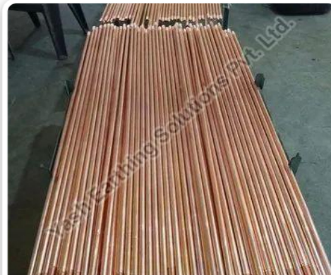
Copper Earthing Bar