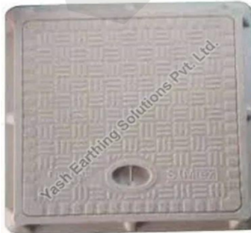
FRP Square Manhole Cover