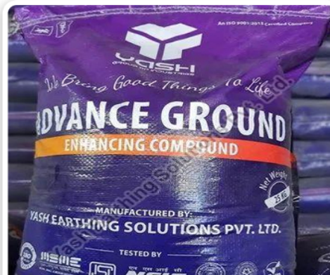
25 Kg Advanced Ground Enhancing Compound