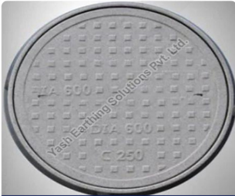
FRP Round Manhole Cover