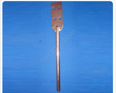
8mm Copper Bonded Earth Rod