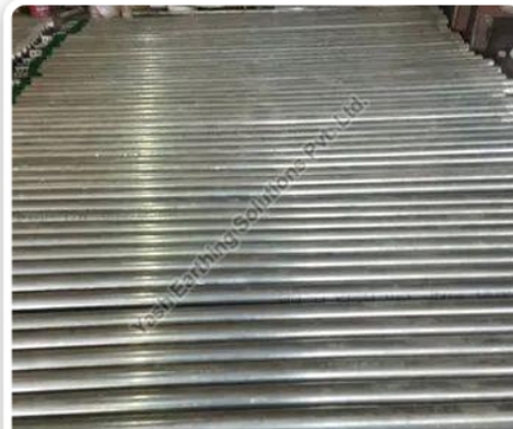
GIPIPE803 GI Earthing Pipe