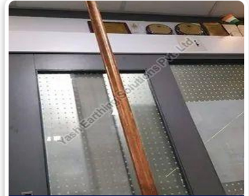
Lightning Protection System