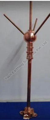
High Voltage Lightning Arrester