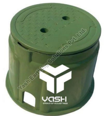
10 Inch Round Earthing Pit Cover