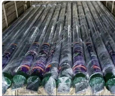
3 Meter Gel Earthing Electrodes