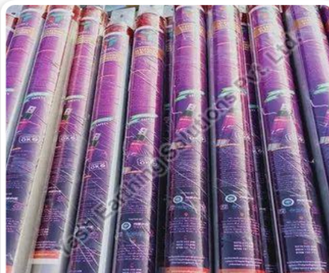
Maintenance Free Earthing Electrode