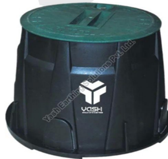
Heavy Duty Earth Pit Cover