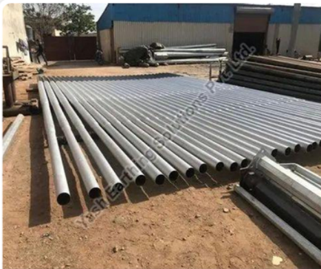
GIP503 GI Earthing Pipe