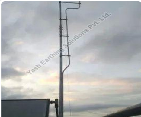
Single Phase Lightning Protector