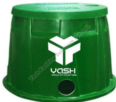
12 Inch Round Earthing Pit Cover