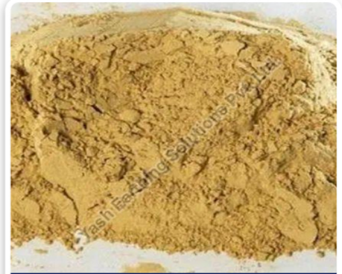
Bentonite Earthing Powder