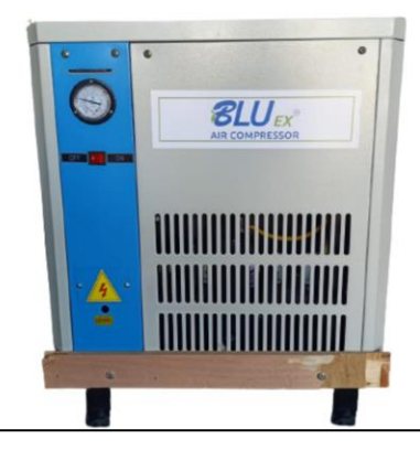
REFRIGERATED AIR DRYER