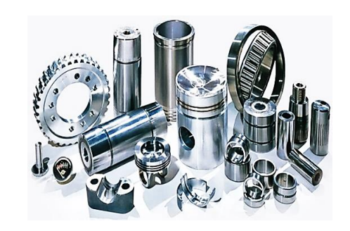
SPARE PARTS OF AIR COMPRESSOR