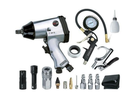
ELECTRIC & PNEUMATIC TOOLS