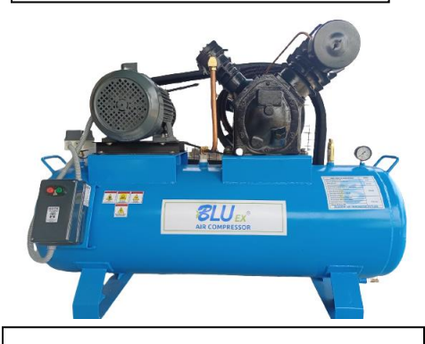
DOUBLE STAGE RECIPROCATING AIR COMPRESSOR