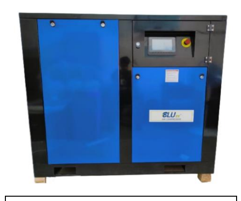
PMV SCREW AIR COMPRESSOR