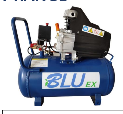
LUBRICATED AIR COMPRESSOR