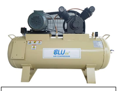
SINGLE STAGE RECIPROCATING AIR COMPRESSOR