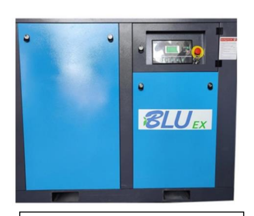
SCREW AIR COMPRESSOR