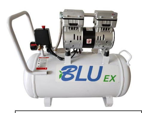
OIL FREE AIR COMPRESSOR