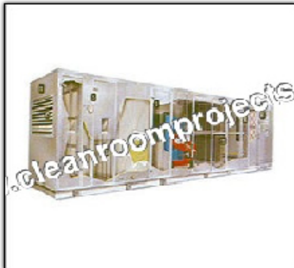
Fume Dust Extraction System