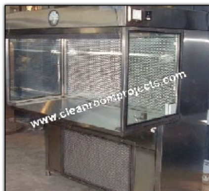
Horizontal Laminar Air Flow Bench