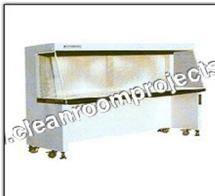
Laminar Flow Bench