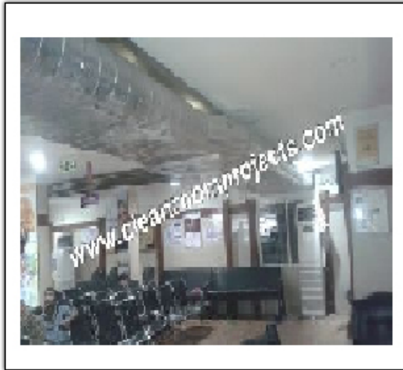
Spiral Ducting Installation Services