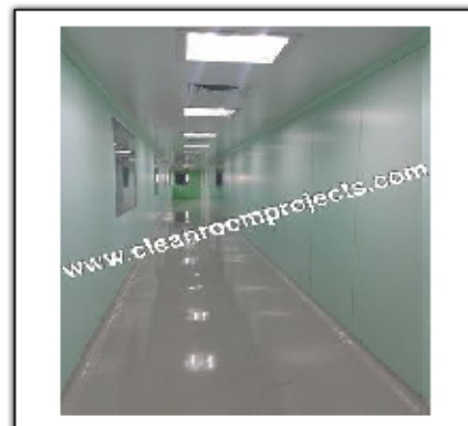
Stainless Steel Modular Clean Room Panel