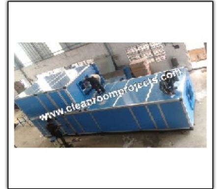
Two Tier Air Handling Unit