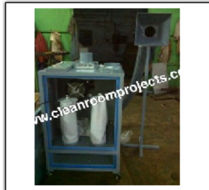
Mobile Dust Extraction System