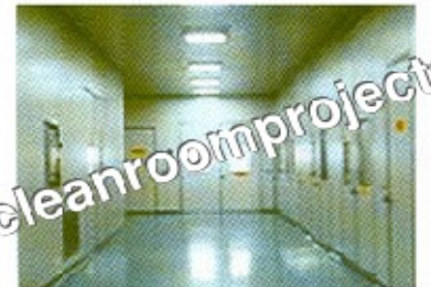
Stainless steel Sandwich Panel