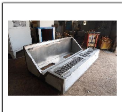
Kitchen Exhaust Hood