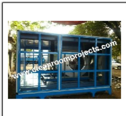
Greenhouse Ventilation System