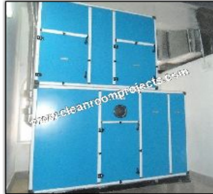
Double Skin Air Handling Unit