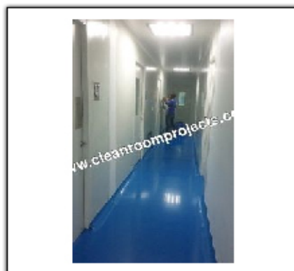
Epoxy Flooring Contractor