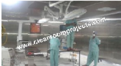
Modular Operation Theatre