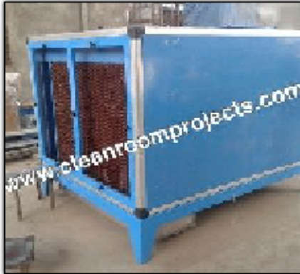
Air Washer Handling Unit