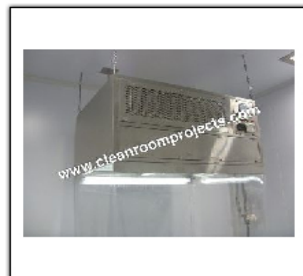
Ceiling Suspended Laminar Air Flow Unit