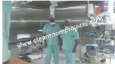
Surgery Operation Theatre