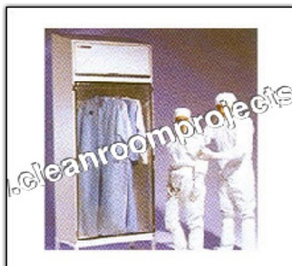
Cleanroom Garment Storage Cabinets