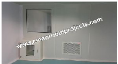
Static Pass Box