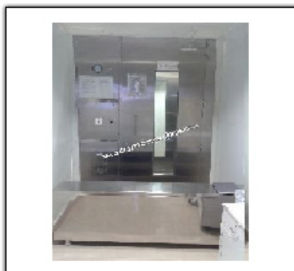
Cleanroom Air Shower