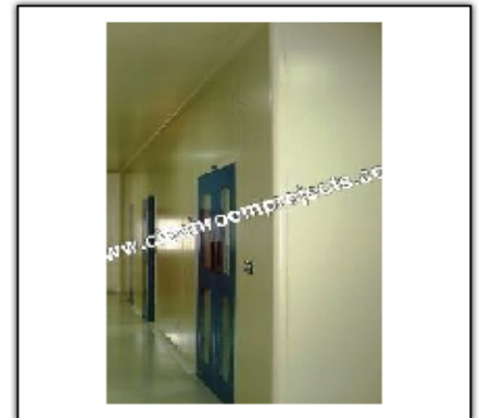
Aluminum Modular Clean Room Panel