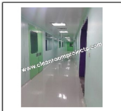
Modular Clean Room Door