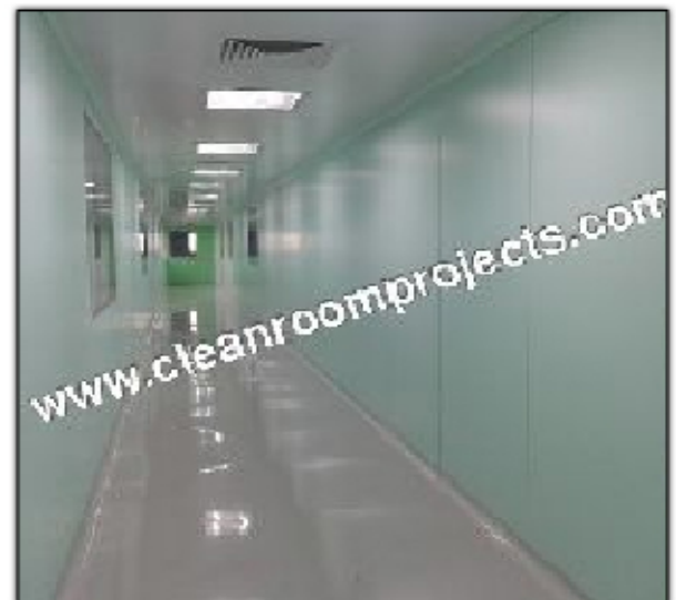
Clean Room Project