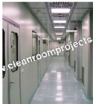
Modular Clean Room