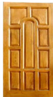
Wooden Door Panel