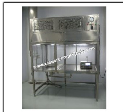
Laminar Air Flow Sink