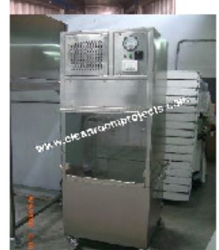
Mobile Dynamic Pass Box