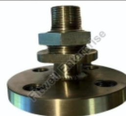
Threaded Hydraulic Flange