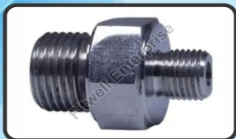
Hydraulic Hex Nipple