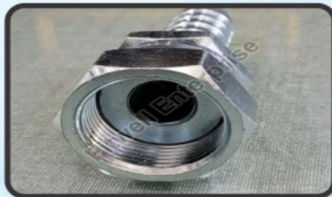
Hydraulic Hose End Fittings Nut