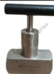
Stainless Steel Needle Valve