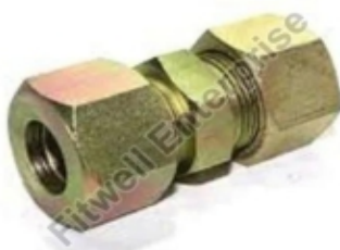
Hydraulic Equal Union Coupling