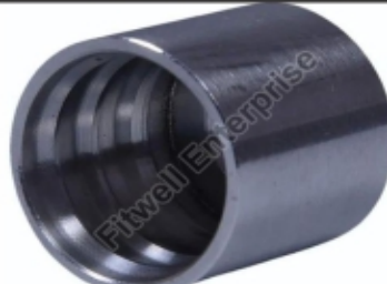
SS 304 Hydraulic Hose Cap