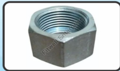
Hydraulic Hose Nut