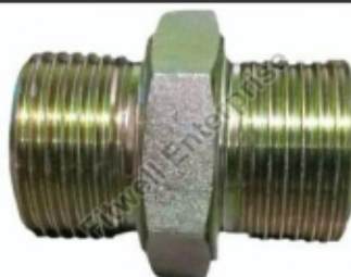
Hydraulic Hex Adaptor