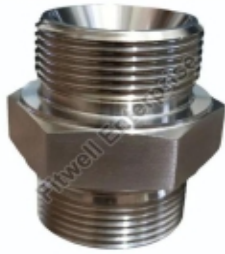
Stainless Steel Hex Nipple