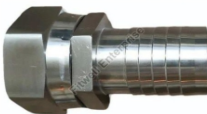
JIC Swivel To Hose Barb