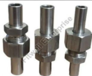
Stainless Steel Pipe Fittings