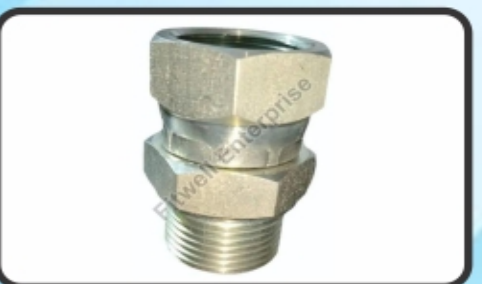
Mild Steel Hex Nipple