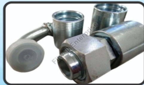
Hydraulic 4SH Hose End Fittings