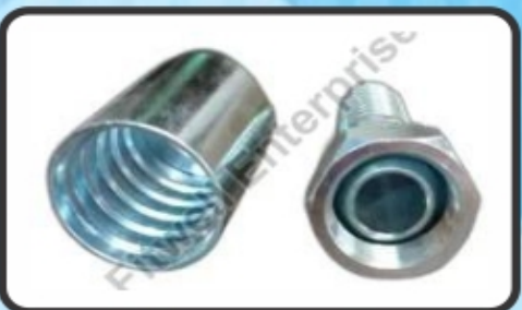
Hydraulic Braided Pipe Fitting