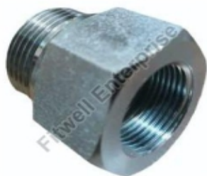
Hydraulic Hose Connector