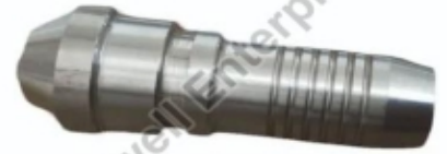
Teflon Hose Nipple