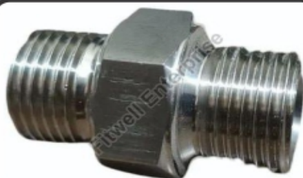
Stainless Steel Female Connector