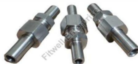
Stainless Steel Tube Fittings