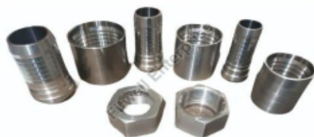
Hydraulic Hose Pipe Fittings