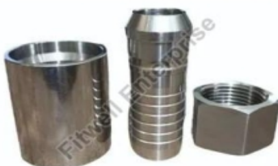
Hydraulic Hose Assemblies