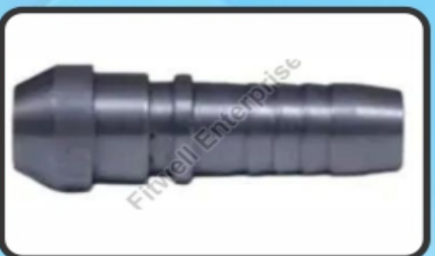
SS 304 Hydraulic Step Nipple