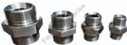
Hydraulic Fitting Adaptor