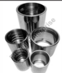
Stainless Steel Hydraulic Hose Fitting Cap