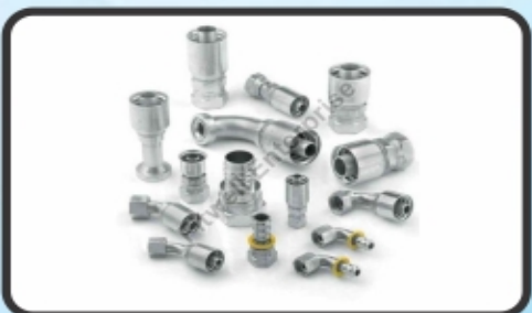
High Pressure Hydraulic Hose Fittings