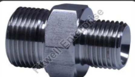
Stainless Steel 3/4 SS Hydraulic Adaptor