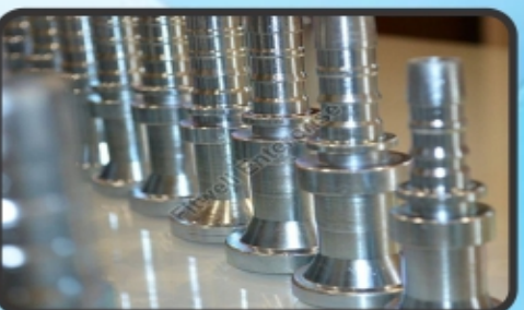
Hydraulic Non Skive Pipe Fitting