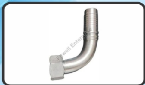
Hydraulic BSP Hose Bend