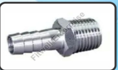
Mild Steel Hose Nipple