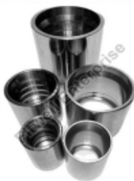
1/2 SS Hydraulic Hose Cap