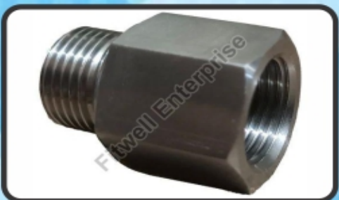
Hydraulic Reducing Nipple