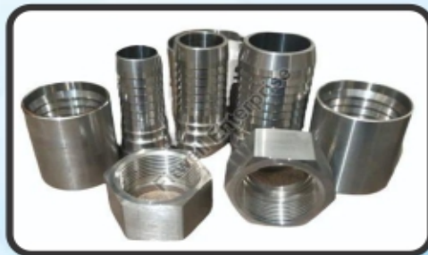
Hydraulic Pipe Fittings