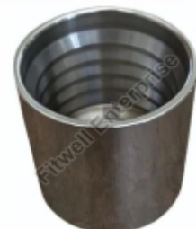
Hydraulic Crimping Cap