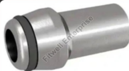
Hydraulic Welding Nipple O Ring Fitting