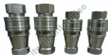
Hydraulic Quick Release Coupling