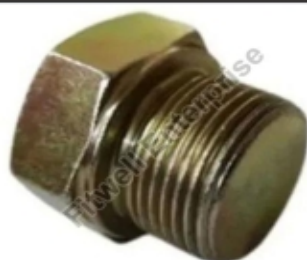
Hydraulic Hex Plug