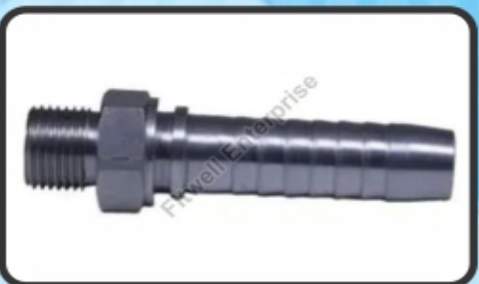
Hydraulic Male Hose Nipple