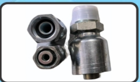
Hydraulic One Piece Fitting