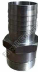
Stainless Steel Male Hose Nipple