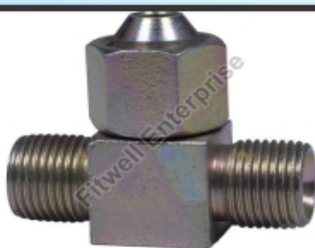
Mild Steel Hydraulic Tee