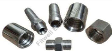
Hydraulic Tube Fitting