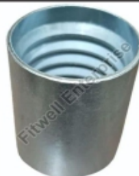
Spiral Hose Cap