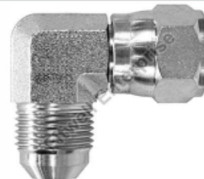
Hydraulic Elbow JIC