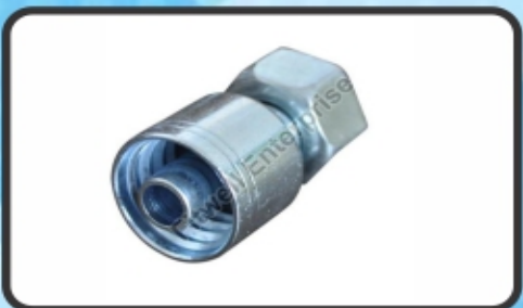
Hydraulic Hose Non Skive Fitting