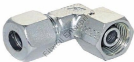
Hydraulic Elbow Swivel