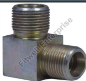
Mild Steel Hydraulic Elbow