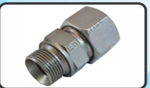
Hydraulic Hose Skive Fitting