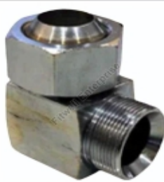
BSP Hydraulic Elbow Fitting