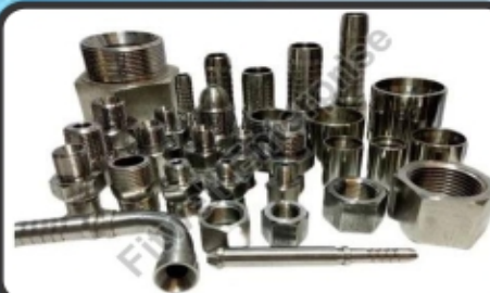
Hydraulic Hose Fittings