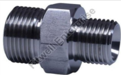
Stainless Steel Adaptor