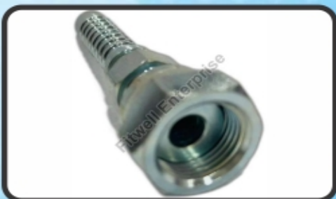
Hydraulic Nut Crimp Type Orfs Fitting