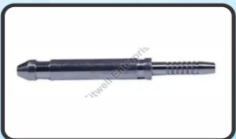
1/2 SS Hydraulic Stem Nipple