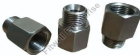
SS Male Female Reducing Connector