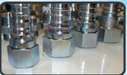
Hydraulic 4SP Non Skive Fitting