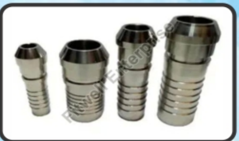
Hydraulic Hose Fitting Nipple