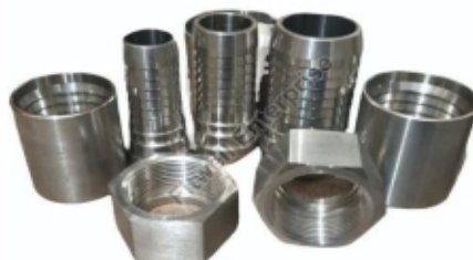
Hydraulic Hose End Fittings