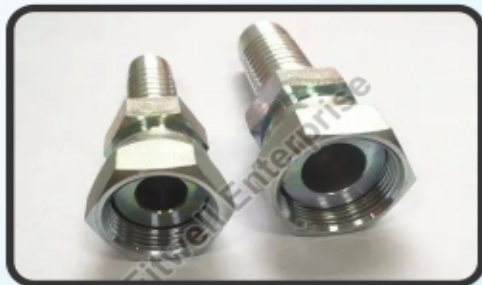
Female Swivel Nut