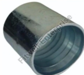
High Pressure Hydraulic Hose Cap