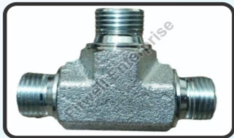
Mild Steel Forging Tee