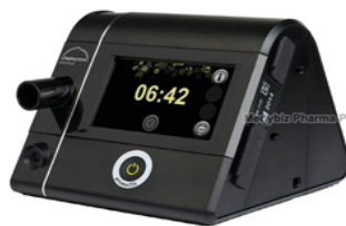
Prisma 25S Bipap Machine