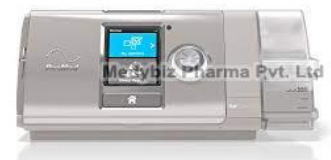
Resmed Aircurve 11 ST Bipap Machine