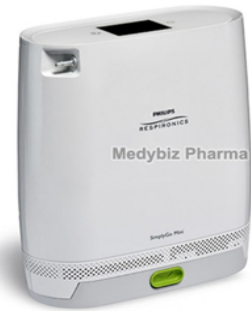
Philips Simplygo Mini Portable Oxygen Concentrator