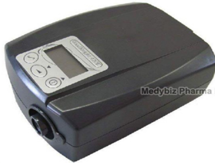
Goodnight 420E Cpap Machine