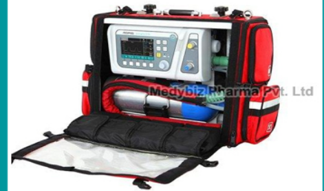
Shangrila 510S Advanced Ventilator