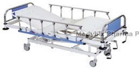
Full Fowler Hospital Bed With ABS Panel