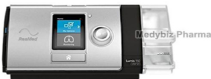
Resmed Lumis & 150 Vpap ST Bipap Machine