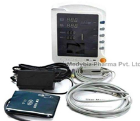
CMS-5100 3 Para Patient Monitor