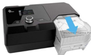
Resmart G2S A20 Cpap Machine