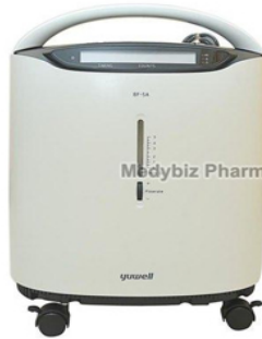
Yuwell 5LPM Oxygen Concentrator