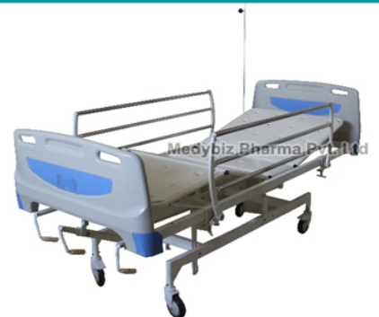
3 Function Manual Hospital Bed With ABS Panel