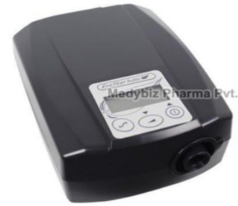
EcoStar Auto Cpap Machine