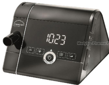
Prisma Smart Cpap Machine