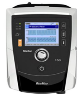
Stellar 150 Non Invasive Advanced Ventilator