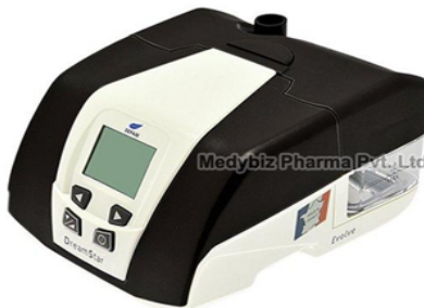
Dreamstar Duo ST Bipap Machine