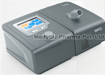
Resplus B-30P Bipap Machine With Humidifier