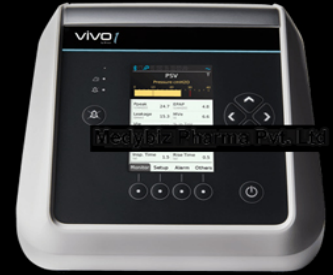
Vivo 1 Bipap Machine