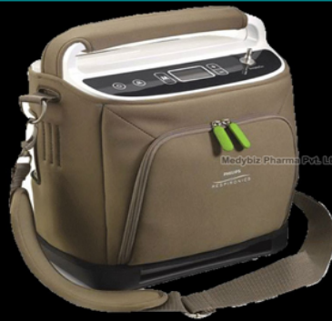
Philips Simplygo Portable Oxygen Concentrator