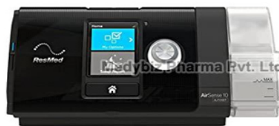
Resmed Airsense 10 Bipap Machine