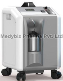
10 LPM Micitech Oxygen Concentrator