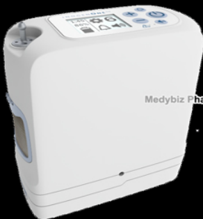
Inogen One G5 Portable Oxygen Concentrator