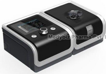
Resmart G2 Auto Cpap Machine