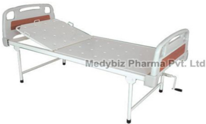
Semi Fowler Hospital Bed With ABS Panel