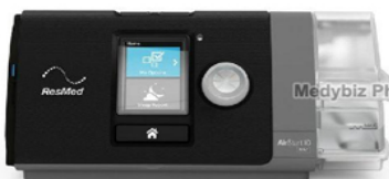
Resmed Airstart 10 Bipap Machine