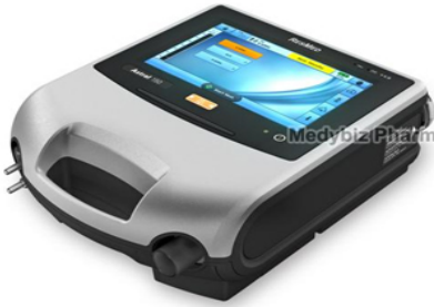
Resmed Astral 150 Advanced Ventilator