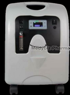
6LPM Oxygen Concentrator