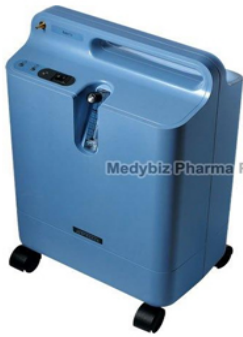
Philips Everflo 5LPM Oxygen Concentrator