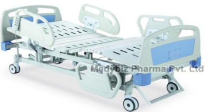
3 Function Motorized Hospital Bed With ABS Panel