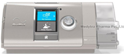
Resmed Aircurve 10 ST Bipap Machine