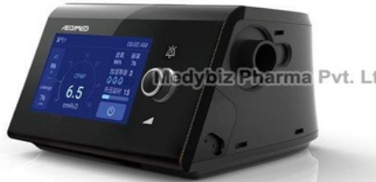
Resmed BF-30ST Bipap Machine