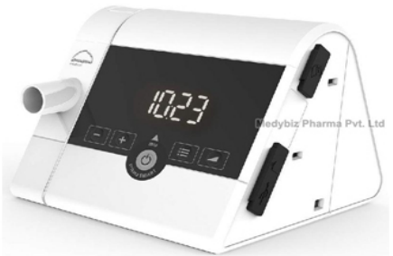
Prisma Smart Plus Cpap Machine