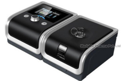
BMC Y30T Bipap Machine With ST Mode Humidifier