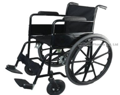
Foldable Spoke Wheelchair