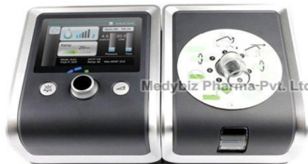
BMC Y25T Bipap Machine