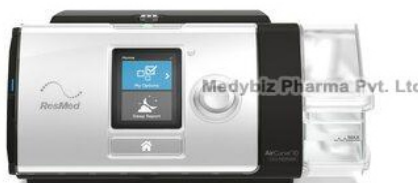
Resmed Aircurve 10 Vauto Bipap Machine