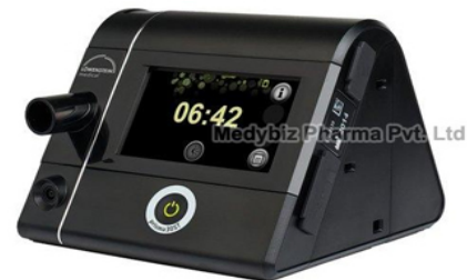
Prisma 30ST Bipap Machine