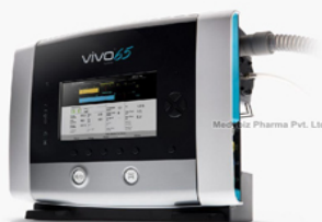
Vivo 66 Breas Advanced Ventilator