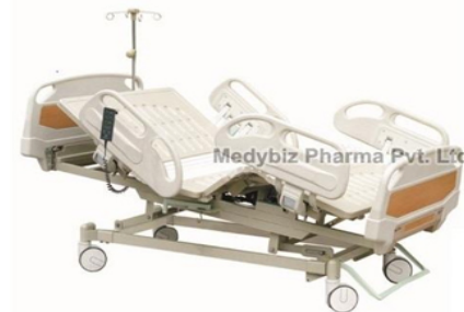
5 Function Motorized Hospital Bed With ABS Panel