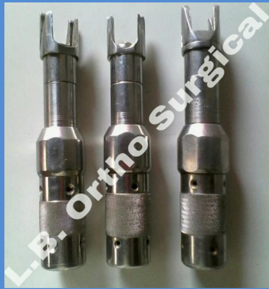
DYANMIC WIRE TENSIONER