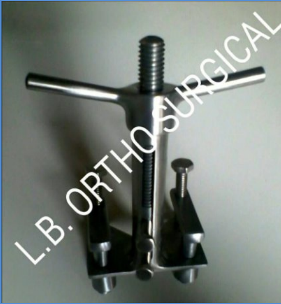
MECHANICAL WIRE TENSIONER