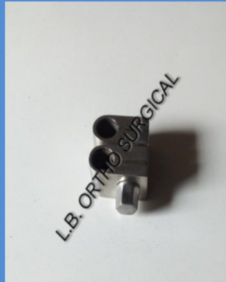
TUBE TO TUBE CLAMP