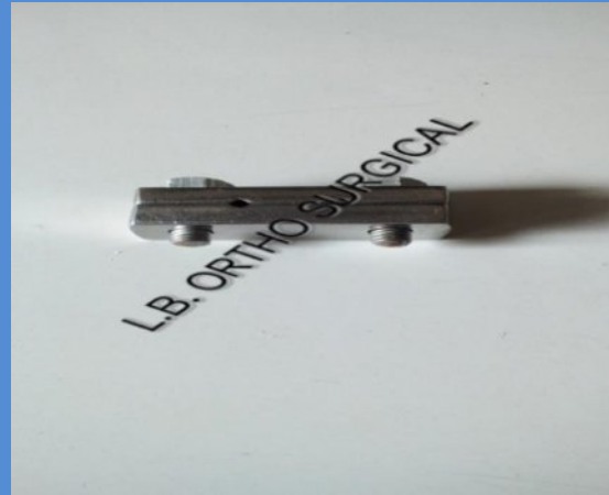
MULTIPLE FIXATION CLAMP