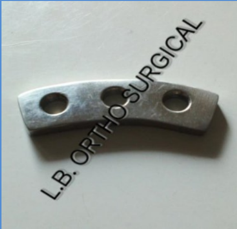
CONNECTION PLATE 3 HOLE