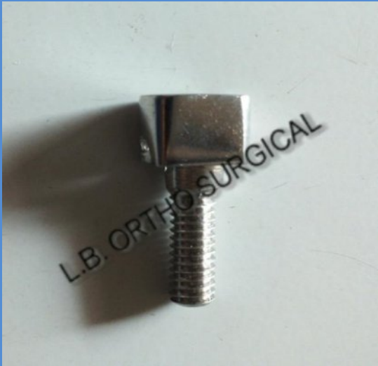
SHANZ FIXATION BOLT