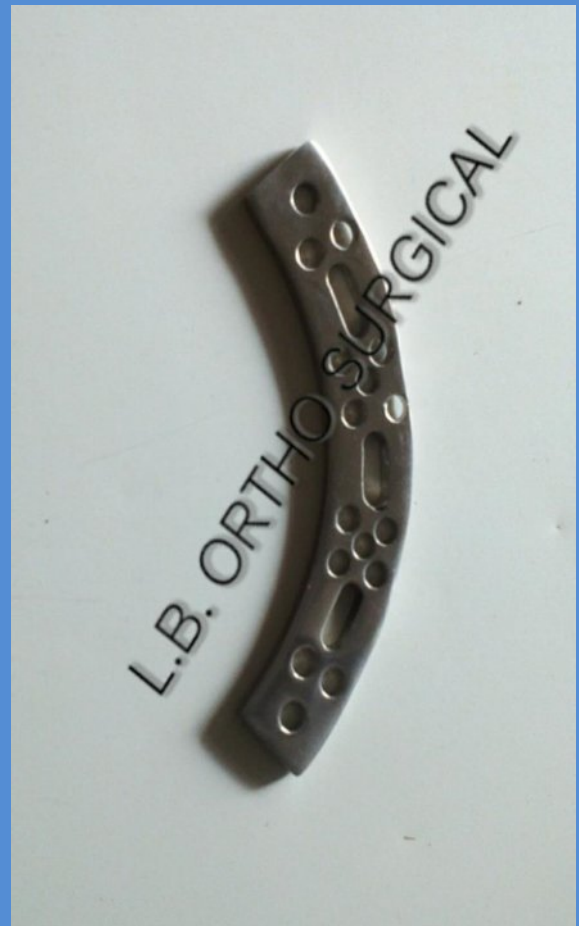
ITALIAN FEMORAL ARCH