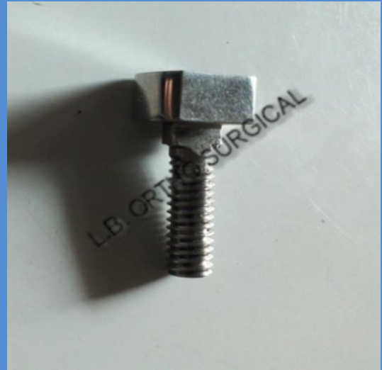
SIDE SLOTTED BOLT