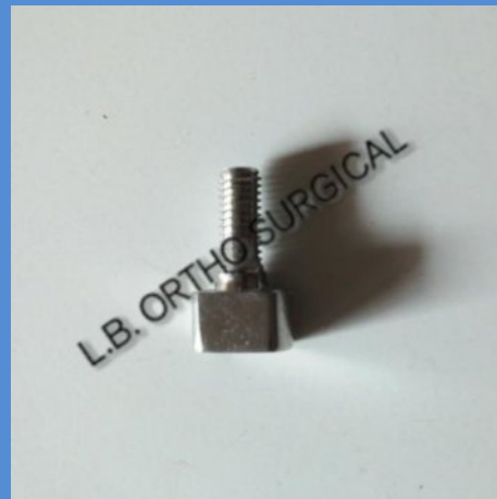
CENTER SLOTTED BOLT