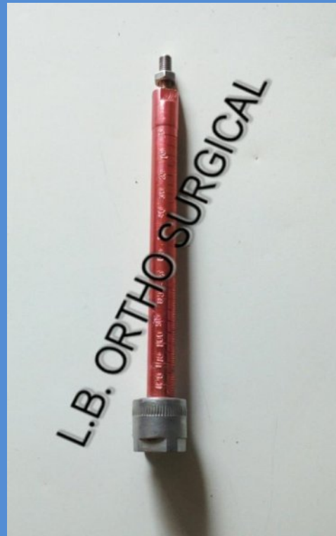
GRADUATED TELESCOPIC ROD