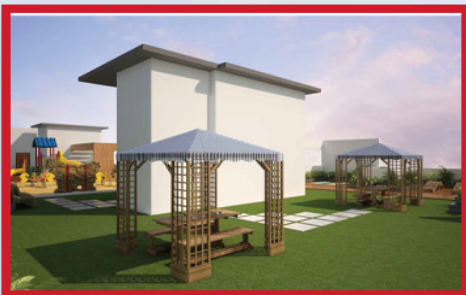
1 BHK Flats & Apartments For Sale In Palghar East, Palghar (361 Sq.ft.)