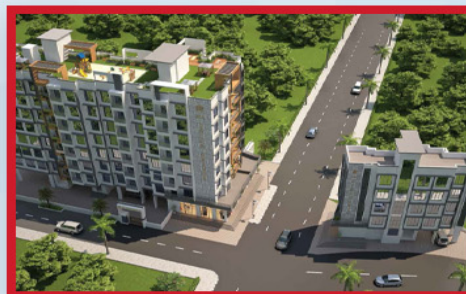
2 BHK Flats & Apartments For Sale In Palghar East, Palghar (614 Sq.ft.)