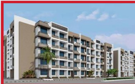
1 BHK Flats & Apartments For Sale In Saphale, Palghar (500 Sq.ft.)