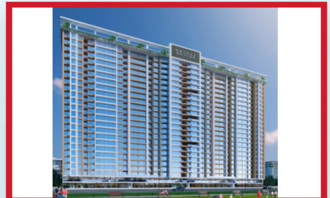
1 BHK Flats & Apartments For Sale In Naigaon East, Mumbai (550 Sq.ft.)