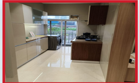
1 BHK Flats & Apartments For Sale In Naigaon West, Mumbai (465 Sq.ft.)