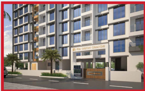
1 BHK Flats & Apartments For Sale In Palghar East, Palghar (390 Sq.ft.)