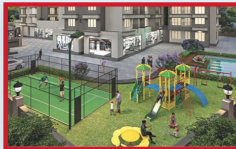
2 BHK Flats & Apartments For Sale In Nalasopara West, Mumbai (624 Sq.ft.)