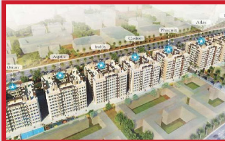
1 BHK Flats & Apartments For Sale In Yashvant Srushti, Palghar (576 Sq.ft.)