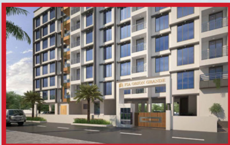
2 BHK Flats & Apartments For Sale In Palghar East, Palghar (481 Sq.ft.)