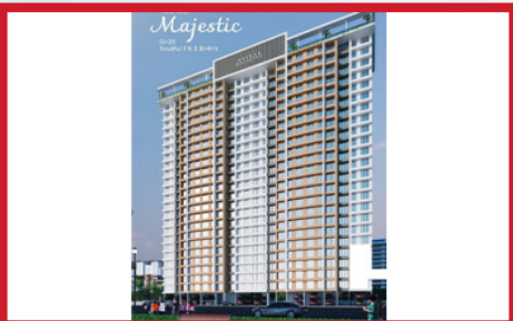
1 BHK Flats & Apartments For Sale In Naigaon West, Mumbai (421 Sq.ft.)