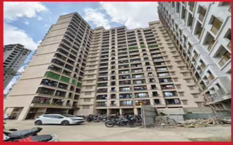
1 BHK Flats & Apartments For Sale In Vasai East, Mumbai (500 Sq.ft.)