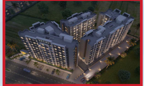
2 BHK Flats & Apartments For Sale In Navali, Palghar (468 Sq.ft.)