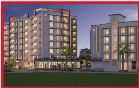
1 BHK Flats & Apartments For Sale In Palghar East, Palghar (370 Sq.ft.)