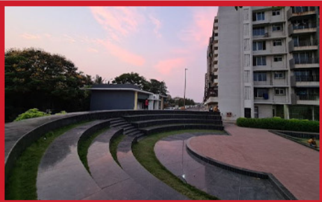
3 BHK Flats & Apartments For Sale In Yashvant Srushti, Palghar (993 Sq.ft.)