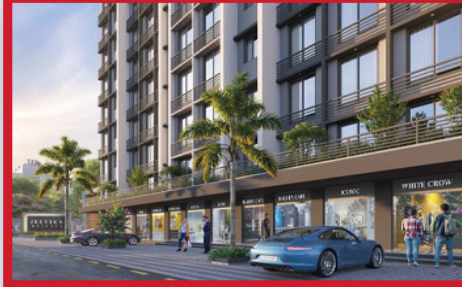
2 BHK Flats & Apartments For Sale In Navali, Palghar (451 Sq.ft.)