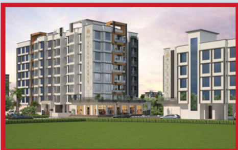
2 BHK Flats & Apartments For Sale In Palghar East, Palghar (345 Sq.ft.)