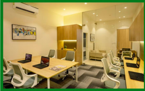
Commercial Business Park Unit At Turbhe

RAIGAD ESTATE DON'T NEGOTIATE YOUR PURCHASE ALONE!