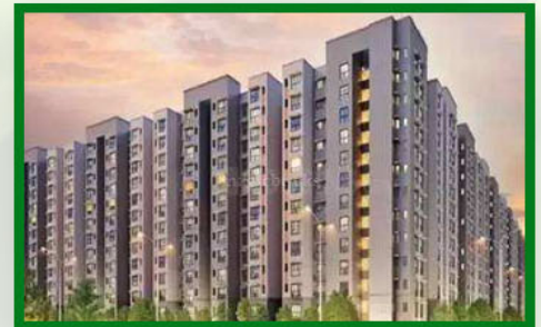
1 BHK Flats & Apartments For Sale In Majiwada, Thane (330 Sq.ft.)

Plot / Land Area 21 Acre Property Type Residential Plot