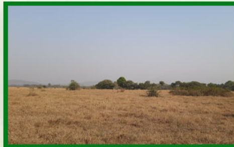
21 Acres TPS CIDCO NAINA Land Behind Panvel Railway Station

Furnishing Unfurnished Property Type Commercial Shops Property On Floor Ground Total Floor 1 Facing East