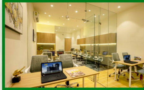
Commercial Business Park Unit At Turbhe

Bathrooms 1 Furnishing Unfurnished Property Type Office Space Property On Floor 11 Total Floor 30 Facing East