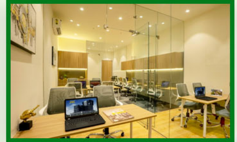
Commercial Business Park Unit At Turbhe

Bathrooms 1 Furnishing Unfurnished Property Type Office Space Property On Floor 8 Total Floor 30 Facing East