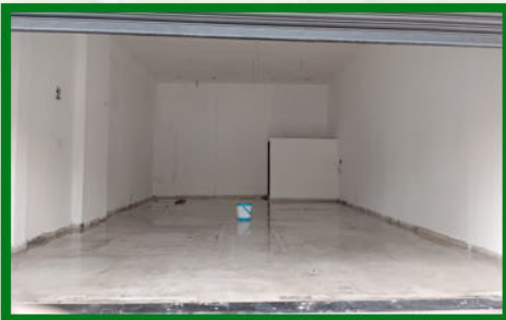
Commercial Shop For Lease At Kharghar Sector 18

Bathrooms 1 Furnishing Unfurnished Property Type Office Space Property On Floor 5 Transaction Type New Property Facing East