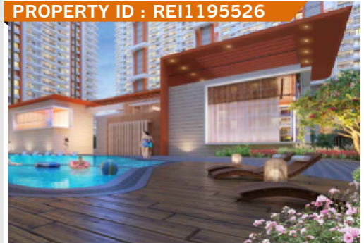
PROPERTY ID : REI1195526

Nyati Emerald in Pune is now offering a well-designed residential property unit. This is well-planned Residential Property Project with all modern facilities and offering 2, 3 BHK Flats / Apartments in Affordable rates.