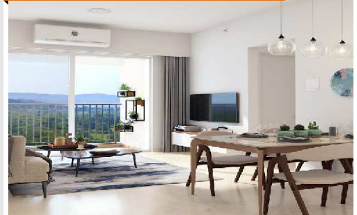
PROPERTY ID : REI935751

Property is located in baner mahalunge road ,its a township project of godrej properties,2bhk flat start from 39 lacs all inclusive call for more details