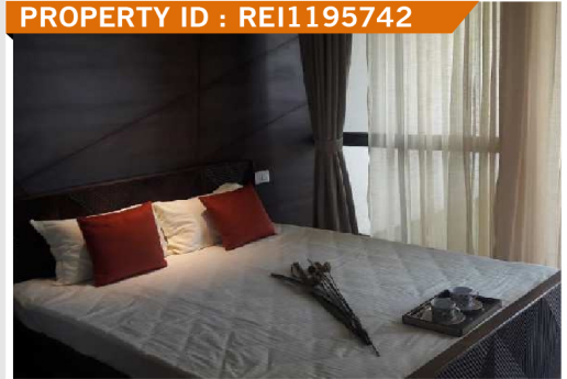
PROPERTY ID : REI1195742

I More Prop Deals is proud to announce its new project Raheja Sterling which is located in the finest locations of Pune. The project is offering 2, 3, 4 BHK Flats / Apartments for sale at an affordable price with a number of modern amenities.