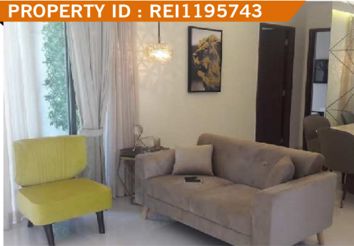
PROPERTY ID : REI1195743

I More Prop Deals is proud to unveil its new venture in the Residential Property real estate . Its Completed Raheja Sterling project is located in Pune which is structured and designed beautifully with an amazing site plan. This project offers 2, 3, 4 BHK Flats / Apartments