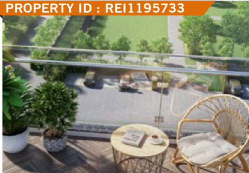
PROPERTY ID : REI1195733

Lodha Bella Vita in Pune is now offering a well-designed residential property unit. This is well-planned Residential Property Project with all modern facilities and offering 2, 3, 4 BHK Flats / Apartments in Affordable rates.