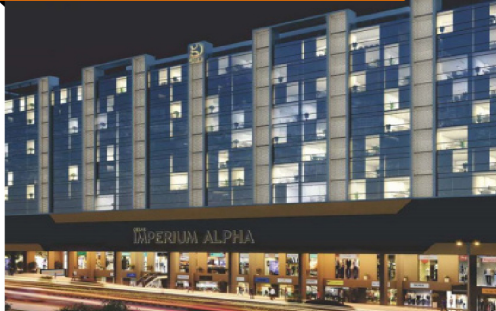
PROPERTY ID : REI1194589

Commercial Shops available for sale at Kharadi, Pune with 100 Sq.ft. area in in 44 Lac INR/ affordable rate / for more please contact in given number.