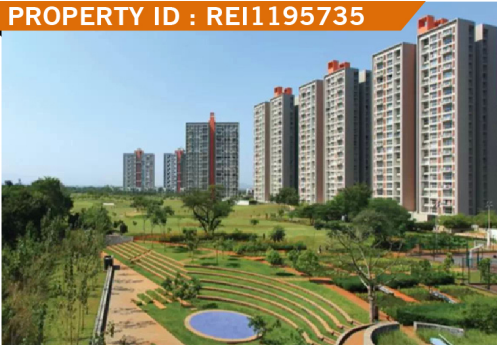
PROPERTY ID : REI1195735

I More Prop Deals is proud to announce its new project Lodha Bella Vita which is located in the finest locations of Pune. The project is offering 2, 3, 4 BHK Flats / Apartments for sale at an affordable price with a number of modern amenities.