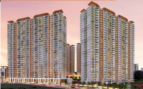
PROPERTY ID : REI1195525

I More Prop Deals is proud to announce its new project Nyati Emerald which is located in the finest locations of Pune. The project is offering 2, 3 BHK Flats / Apartments for sale at an affordable price with a number of modern amenities.