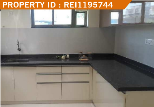
PROPERTY ID : REI1195744

I More Prop Deals is proud to unveil its new venture in the Residential Property real estate . Its Completed Raheja Sterling project is located in Pune which is structured and designed beautifully with an amazing site plan. This project offers 2, 3, 4 BHK Flats / Apartments