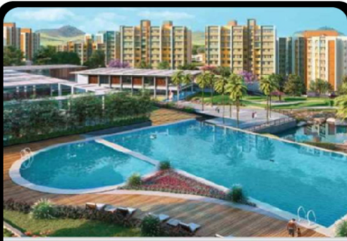
1 BHK Flats & Apartments For Sale In Neral, Raigad (502 Sq.ft.)