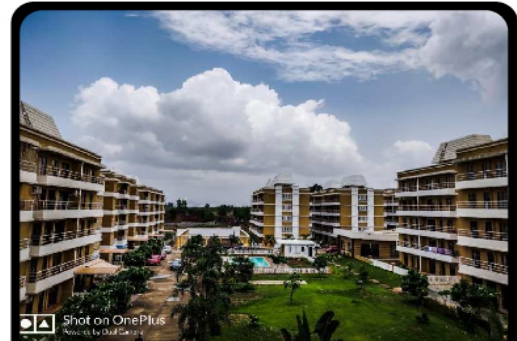
2 BHK Flats & Apartments For Sale In Neral, Raigad (780 Sq.ft.)