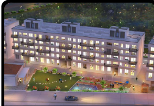
1 BHK Flats & Apartments For Sale In Neral, Mumbai (391 Sq.ft.)