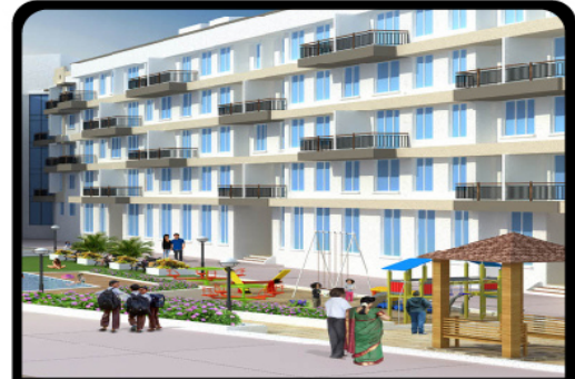
1 BHK Flats & Apartments For Sale In Neral, Mumbai (344 Sq.ft.)