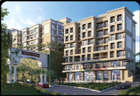
167 Sq.ft. Commercial Shops For Sale In Karjat, Mumbai