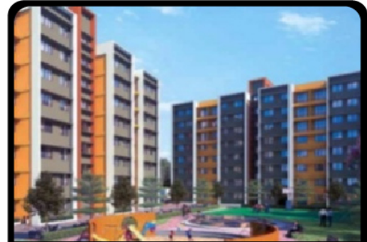
1 BHK Flats & Apartments For Sale In Neral, Raigad (501 Sq.ft.)