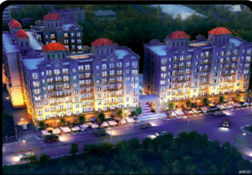
2 BHK Flats & Apartments For Sale In Neral, Mumbai (431 Sq.ft.)