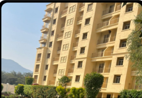
2 BHK Flats & Apartments For Sale In Neral, Raigad (900 Sq.ft.)