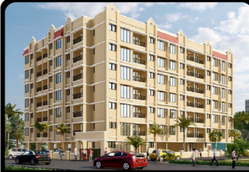
1 BHK Flats & Apartments For Sale In Neral, Mumbai (325 Sq.ft.)