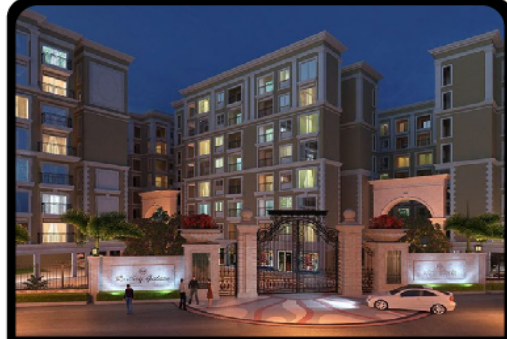
429 Sq.ft. Commercial Shops For Sale In Karjat, Mumbai