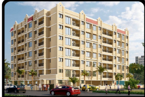
1 RK Flats & Apartments For Sale In Neral, Mumbai (244 Sq.ft.)