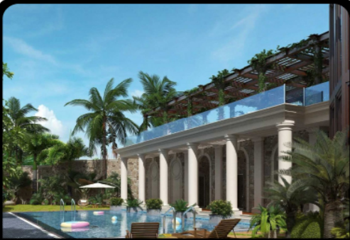
2 BHK Flats & Apartments For Sale In Karjat, Mumbai (550 Sq.ft.)