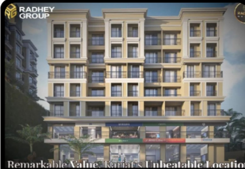
Remarkable Value, Karjat's Unbeatable Location 1 BHK Flats & Apartments For Sale In Karjat, Mumbai (377 Sq.ft.)