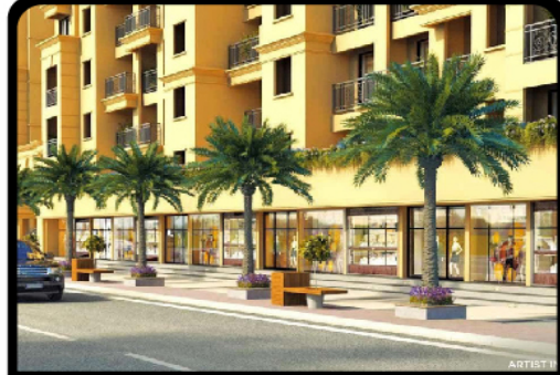
2 BHK Flats & Apartments For Sale In Neral, Mumbai (454 Sq.ft.)