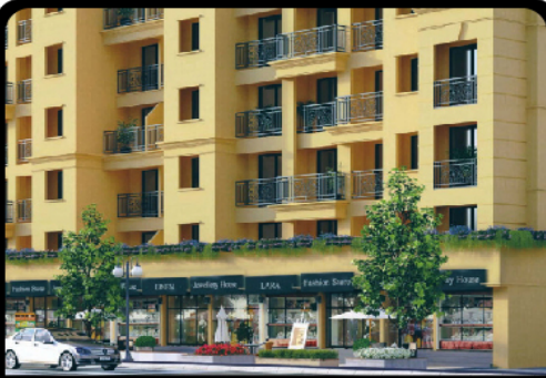
2 BHK Flats & Apartments For Sale In Neral, Mumbai (452 Sq.ft.)