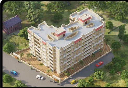
1 RK Flats & Apartments For Sale In Neral, Mumbai (252 Sq.ft.)