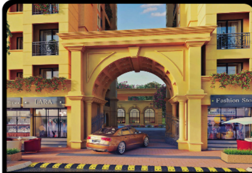
2 BHK Flats & Apartments For Sale In Neral, Mumbai (450 Sq.ft.)