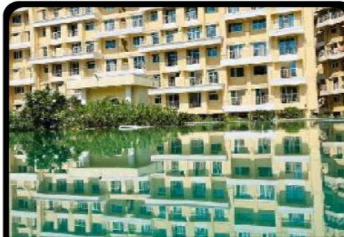
1 BHK Flats & Apartments For Sale In Neral, Raigad (610 Sq.ft.)