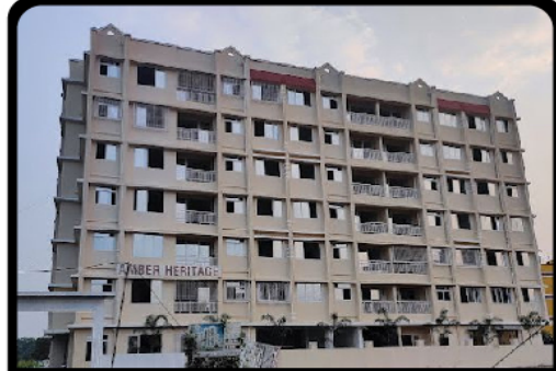
1 BHK Flats & Apartments For Sale In Neral, Mumbai (336 Sq.ft.)