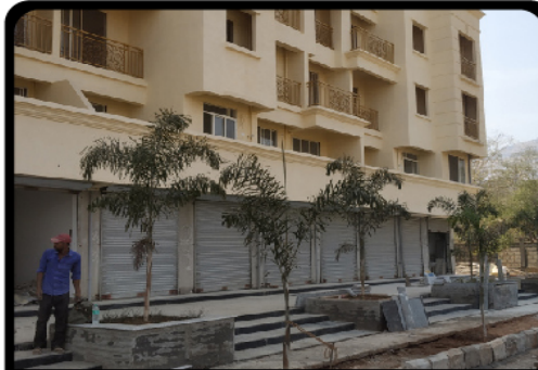
2 BHK Flats & Apartments For Sale In Neral, Raigad (900 Sq.ft.)