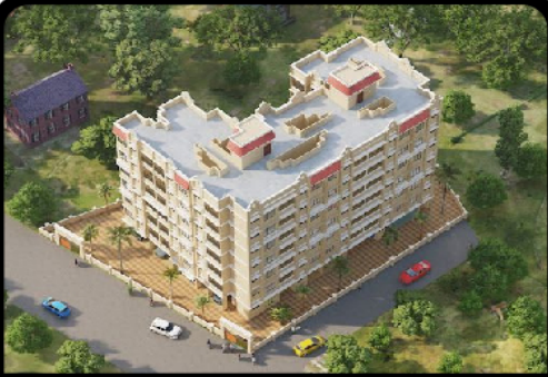
1 BHK Flats & Apartments For Sale In Neral, Mumbai (327 Sq.ft.)