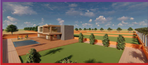
844 Sq. Yards Farm House For Sale In NH 11, Bharatpur