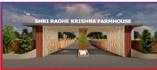
802 Sq. Yards Farm House For Sale In NH 11, Bharatpur