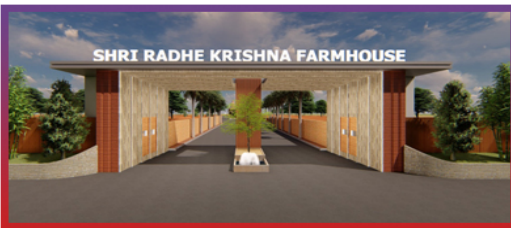
763 Sq. Yards Farm House For Sale In NH 11, Bharatpur