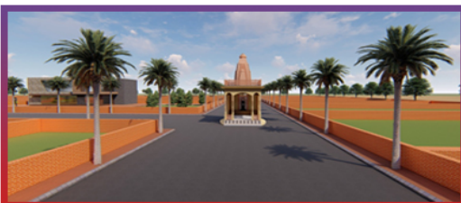
758 Sq. Yards Farm House For Sale In NH 11, Bharatpur