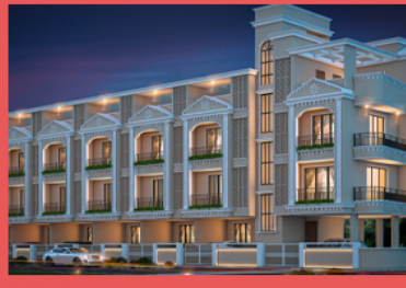
3 BHK Individual Houses For Sale In Mahim Road Mahim Road, Palghar (3400 Sq.ft.)