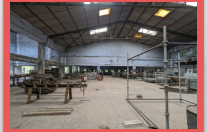
10000 Sq. Meter Factory / Industrial Building For Sale In MIDC Tarapur, Palghar