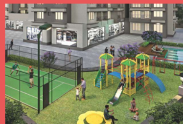
2 BHK Flats & Apartments For Sale In Nalasopara West, Mumbai (592 Sq.ft.)