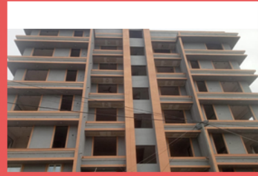
1 BHK Flats & Apartments For Sale In Palghar West, Palghar (684 Sq.ft.)