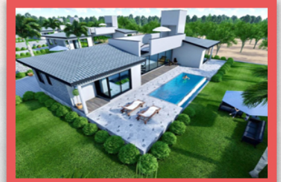
3 BHK Farm House For Sale In Manor, Palghar (20000 Sq.ft.)