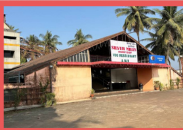
60 Guntha Hotel & Restaurant For Rent In Manor, Palghar