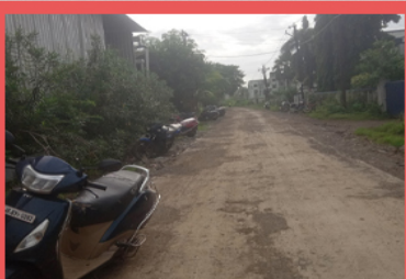
12000 Sq.ft. Factory / Industrial Building For Rent In Bidco, Palghar