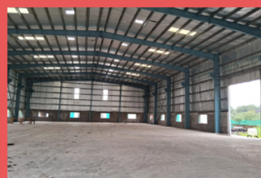
25000 Sq.ft. Factory / Industrial Building For Rent In Wada, Palghar