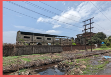
7000 Sq. Meter Factory / Industrial Building For Sale In MIDC Tarapur, Palghar