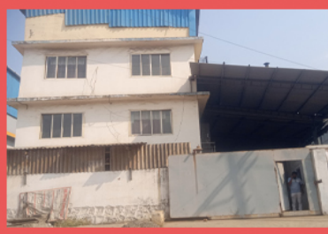
8000 Sq.ft. Factory / Industrial Building For Sale In Boisar West, Palghar