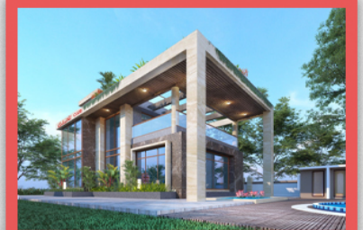
3 BHK Individual Houses For Sale In Palghar West, Palghar (2400 Sq.ft.)