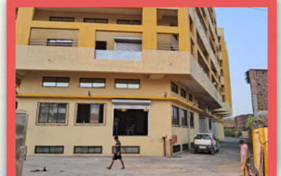
100000 Sq.ft. Factory / Industrial Building For Rent In Vasai, Mumbai