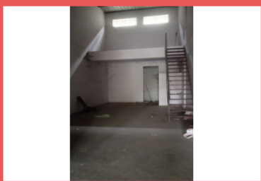
1000 Sq.ft. Commercial Shops For Rent In Palghar West, Palghar