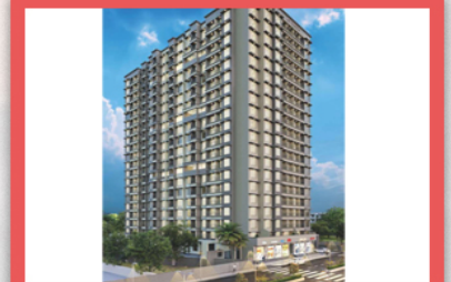
1 BHK Flats & Apartments For Sale In Nalasopara West, Mumbai (384 Sq.ft.)