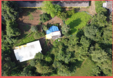
1 BHK Farm House For Sale In Palghar (5 Acre)