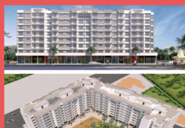
2 BHK Flats & Apartments For Sale In Palghar West, Palghar (890 Sq.ft.)