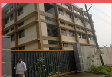
51000 Sq.ft. Factory / Industrial Building For Rent In Bidco, Palghar