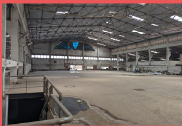
11500 Sq. Meter Factory / Industrial Building For Sale In MIDC Tarapur, Palghar