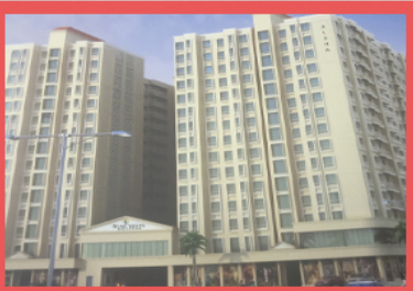
1 BHK Flats & Apartments For Sale In Mahim Road Mahim Road, Palghar (600 Sq.ft.)