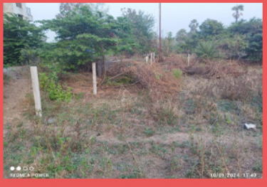
11 Guntha Residential Plot For Sale In Shirgaon, Palghar