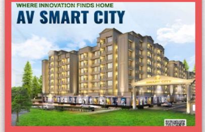
2 BHK Flats & Apartments For Sale In Palghar West, Palghar (860 Sq.ft.)