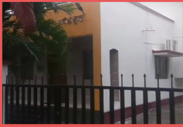
2 BHK Farm House For Sale In Kelwa, Palghar (20 Guntha)