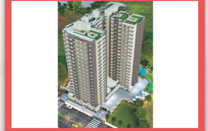
2 BHK Flats & Apartments For Sale In Nalasopara West, Mumbai (624 Sq.ft.)