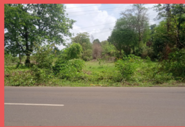
2.5 Acre Agricultural/Farm Land For Sale In Palghar East, Palghar