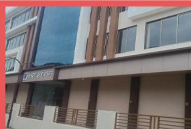
1000 Sq.ft. Business Center For Sale In Palghar West, Palghar