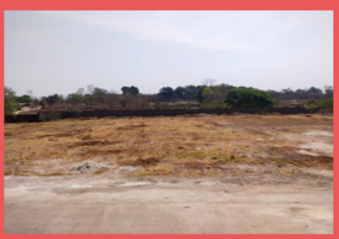
11 Acre Agricultural/Farm Land For Sale In Vikramgad, Palghar