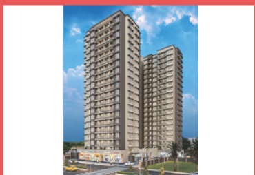
2 BHK Flats & Apartments For Sale In Nalasopara West, Mumbai (617 Sq.ft.)