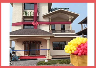
3 BHK Individual Houses / Villas For Sale In Boisar East, Palghar (3200 Sq.ft.)