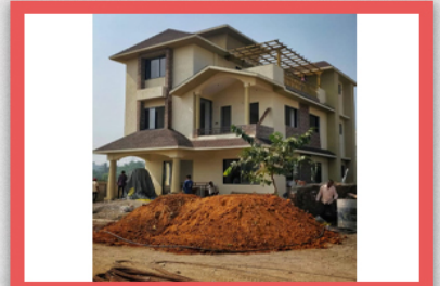
5 BHK Individual Houses / Villas For Sale In Khaira, Palghar (4500 Sq.ft.)