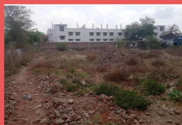
18 Guntha Industrial Land / Plot For Sale In Palghar West, Palghar