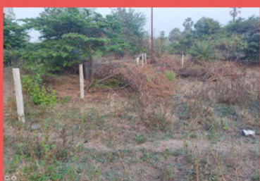
2400 Sq.ft. Residential Plot For Sale In Mahim Road, Palghar