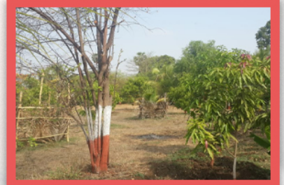
126 Acre Agricultural/Farm Land For Sale In Talasari, Palghar