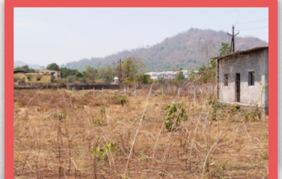
82000 Sq.ft. Industrial Land / Plot For Sale In Wada, Palghar