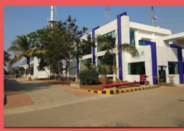
6 Acre Factory / Industrial Building For Sale In Talasari, Palghar