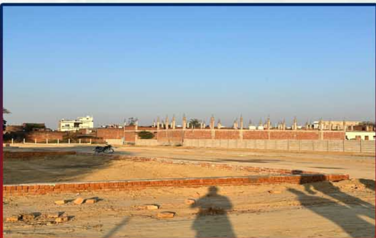
1800 Sq.ft. Residential Plot For Sale In Raibareli Road, Lucknow