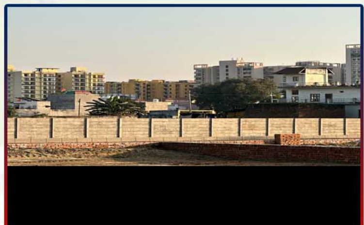
1000 Sq.ft. Residential Plot For Sale In Raibareli Road, Lucknow