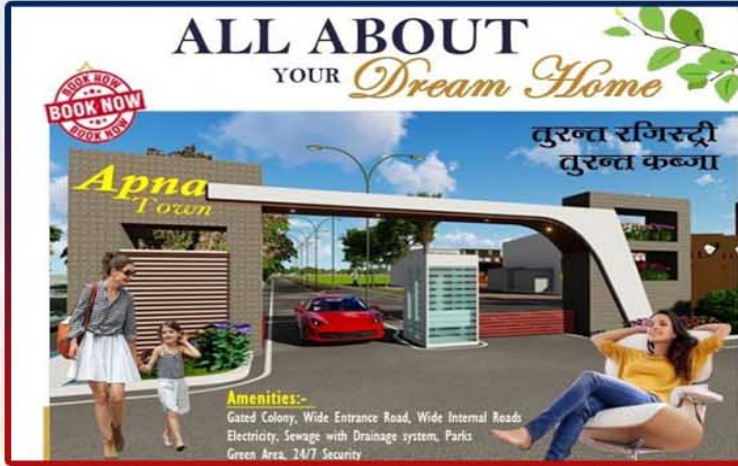
1000 Sq.ft. Residential Plot For Sale In Faizabad Road, Lucknow