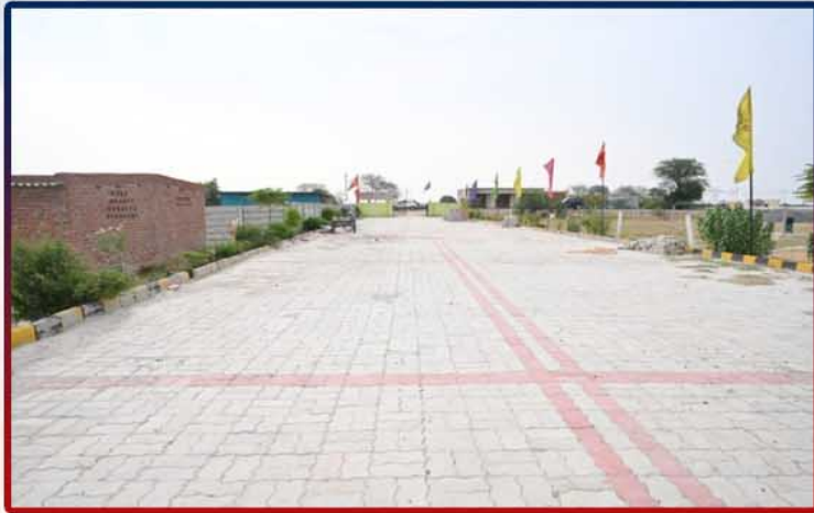
3000 Sq.ft. Residential Plot For Sale In Mohanlalganj, Lucknow