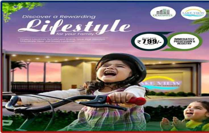
1000 Sq.ft. Residential Plot For Sale In Avas Vikas Colony, Lucknow