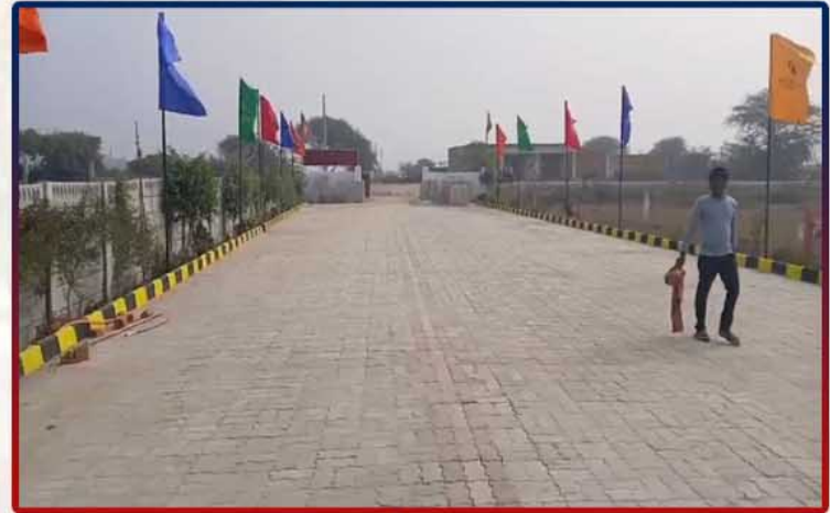
2000 Sq.ft. Residential Plot For Sale In Mohanlalganj, Lucknow