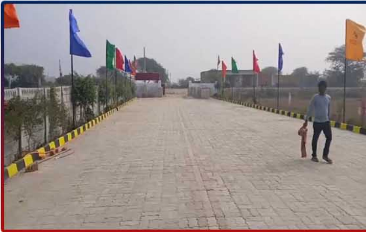
7500 Sq.ft. Residential Plot For Sale In Mohanlalganj, Lucknow