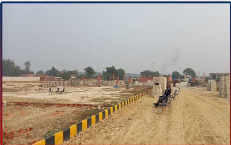
1500 Sq.ft. Residential Plot For Sale In Mohanlalganj, Lucknow