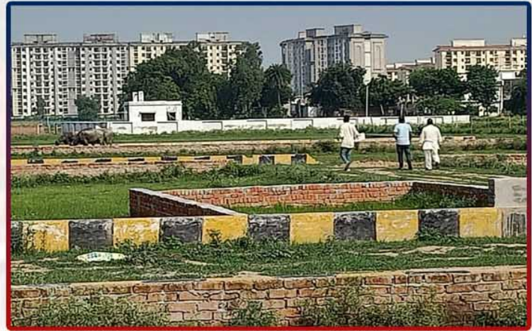
800 Sq.ft. Residential Plot For Sale In Faizabad Road, Lucknow