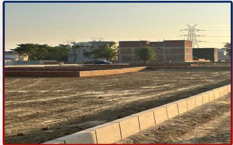
1500 Sq.ft. Residential Plot For Sale In Raibareli Road, Lucknow