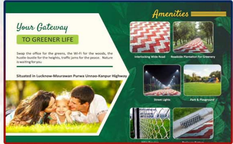
3000 Sq.ft. Residential Plot For Sale In Mohanlalganj, Lucknow