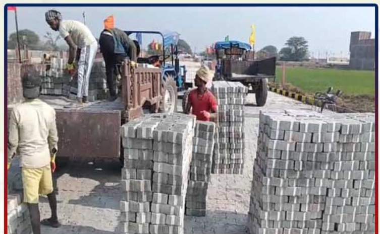
1000 Sq.ft. Residential Plot For Sale In Mohanlalganj, Lucknow