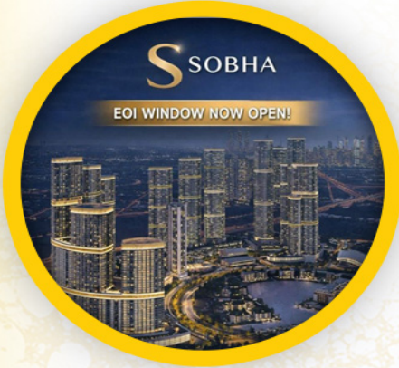
Sobha The One World