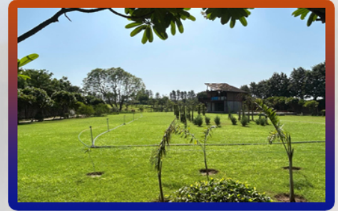
1 RK Farm House For Sale In Sohna Palwal Road Sohna Palwal Road, Gurgaon (2 Acre)