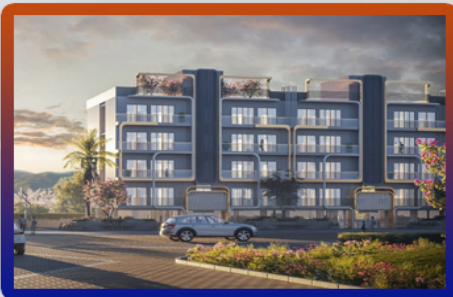
3 BHK Builder Floor For Sale In Sector 79, Gurgaon (1528 Sq.ft.)