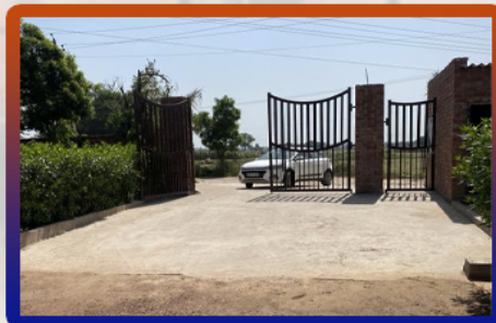
5 Acre Warehouse/Godown For Sale In Bhondsi, Gurgaon