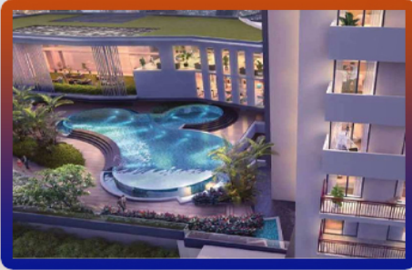
3 BHK Flats & Apartments For Sale In Sector 113, Gurgaon (1840 Sq.ft.)