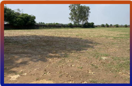
10 Acre Agricultural/Farm Land For Sale In Tauru, Nuh