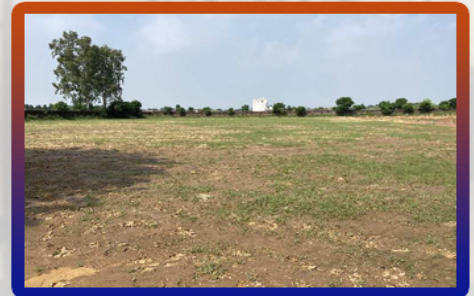
10 Acre Agricultural/Farm Land For Sale In Sohna Palwal Road, Gurgaon