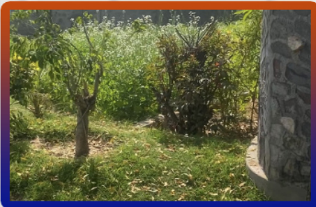
1 RK Farm House For Sale In Bhondsi, Gurgaon (2216 Sq.ft.)