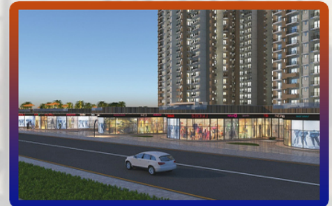
3 BHK Flats & Apartments For Sale In Sector 5, Gurgaon (625 Sq.ft.)