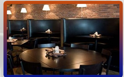
350 Sq.ft. Commercial Shops For Sale In Sohna, Gurgaon