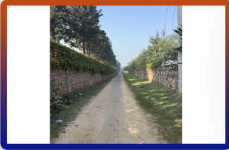
1 BHK Farm House For Sale In Sohna, Gurgaon (2 Acre)