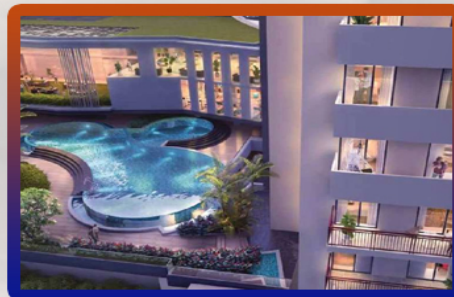
4 BHK Flats & Apartments For Sale In Sector 113, Gurgaon (2600 Sq.ft.)