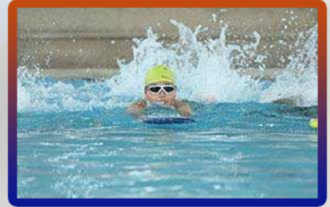
10 Acre Commercial Lands /Inst. Land For Sale In Sohna, Gurgaon