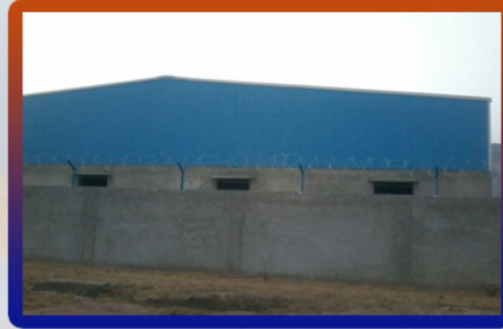
4000 Sq. Yards Factory / Industrial Building For Sale In Gurgaon