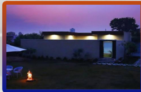
3 BHK Farm House For Sale In Bhondsi, Gurgaon (1816 Sq. Yards)