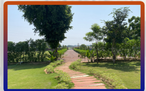
2 BHK Farm House For Sale In Sohna Palwal Road, Gurgaon (3 Acre)