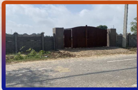
31 Acre Agricultural/Farm Land For Sale In NH 2, Palwal