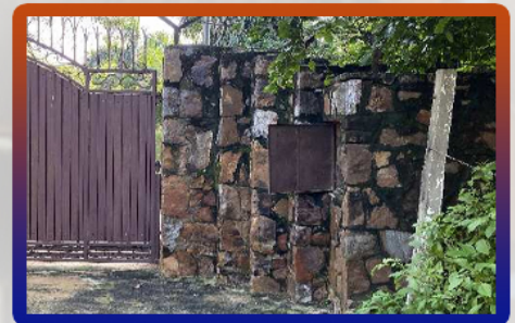
Agriculture Farmland Or Industrial Use