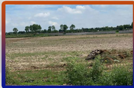
2 Acre Agricultural/Farm Land For Sale In Sohna, Gurgaon