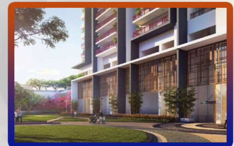
3 BHK Flats & Apartments For Sale In Sector 113, Gurgaon (2050 Sq.ft.)