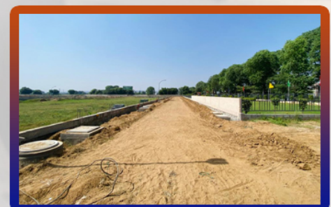
133 Sq. Yards Residential Plot For Sale In Sohna, Gurgaon