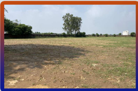
2 Acre Agricultural/Farm Land For Sale In Sohna, Gurgaon