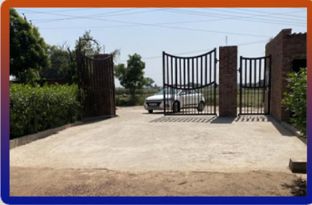
1 RK Farm House For Sale In Sohna, Gurgaon (9600 Sq. Yards)