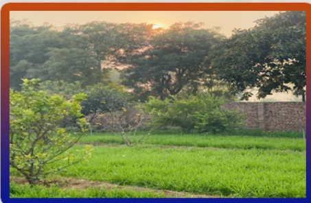
2 Acre Agricultural/Farm Land For Sale In Sohna, Gurgaon