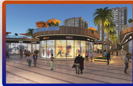
250 Sq.ft. Commercial Shops For Sale In Sector 5, Gurgaon