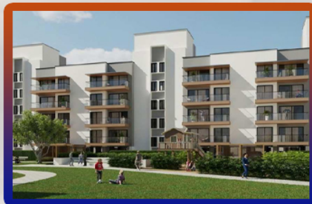
3 BHK Builder Floor For Sale In Sector 63 A, Gurgaon (1600 Sq.ft.)