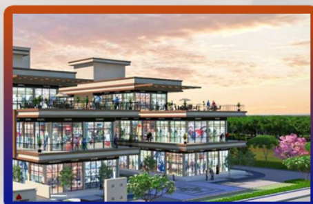
310 Sq.ft. Commercial Shops For Sale In Sohna, Gurgaon