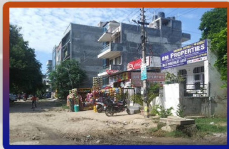
300 Sq. Yards Residential Plot For Sale In Sector 55, Gurgaon