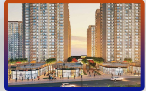
365 Sq.ft. Commercial Shops For Sale In Haryana