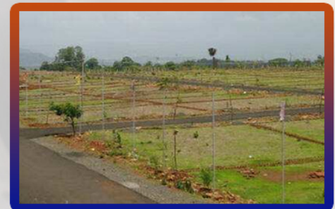
4 Acre Agricultural/Farm Land For Sale In Ballabhgarh, Faridabad