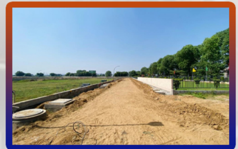
133 Sq. Yards Residential Plot For Sale In Sohna, Gurgaon