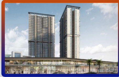
2 BHK Flats & Apartments For Sale In Sector 113, Gurgaon (1370 Sq.ft.)