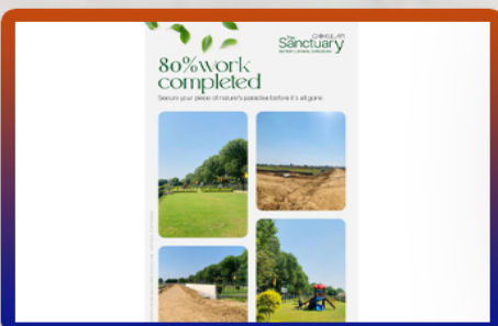
179 Sq. Yards Residential Plot For Sale In Sohna, Gurgaon