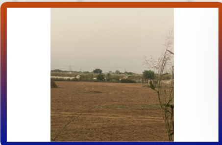
6 Acre Agricultural/Farm Land For Sale In Sohna, Gurgaon