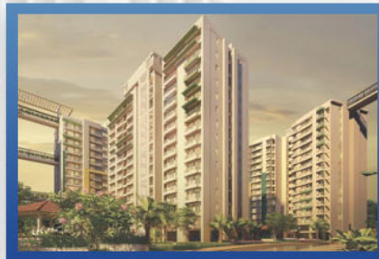
My Haveli - Jaipur