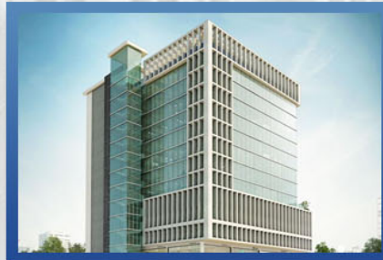
Unique Ace - Jaipur