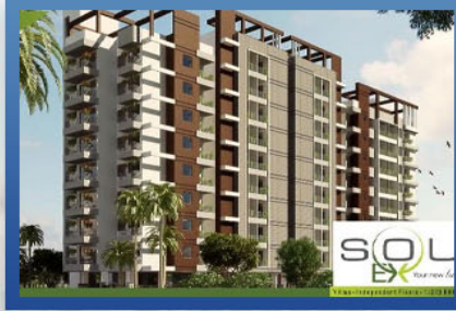
Springfield - Jaipur