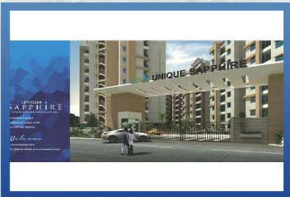
Unique Sapphire - Jaipur