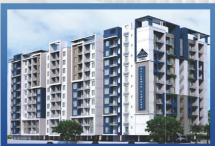
Sampada - Jaipur