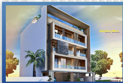
Vishrant Soham - Jaipur