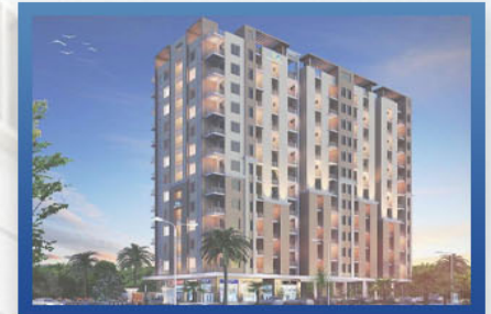
Unique Vidyadeep - Jaipur